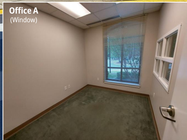
Office A (Window)