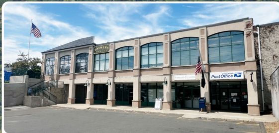
264 HEIGHTS ROAD

$2M Average Home Value, up 10% Year-Over-Year