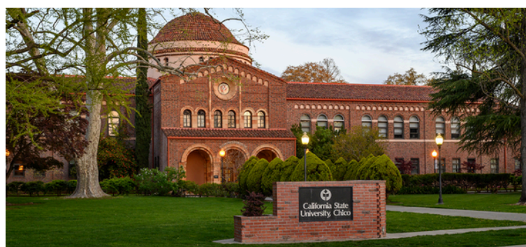
Pictured: CSU Chico, Bidwell Park, Sierra Nevada Brewery