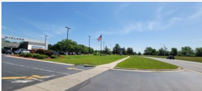
View to the East