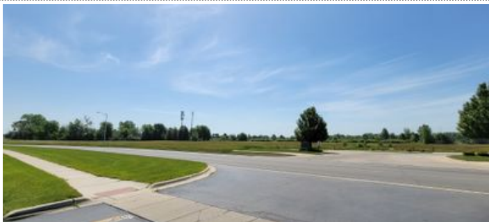
View from the Lincoln Dealer