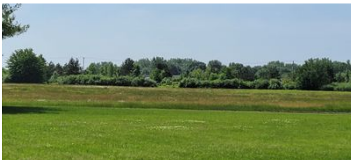
Joe Mann Blvd. View