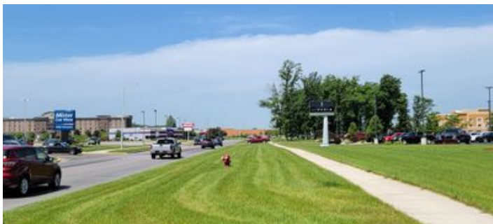
View to the West