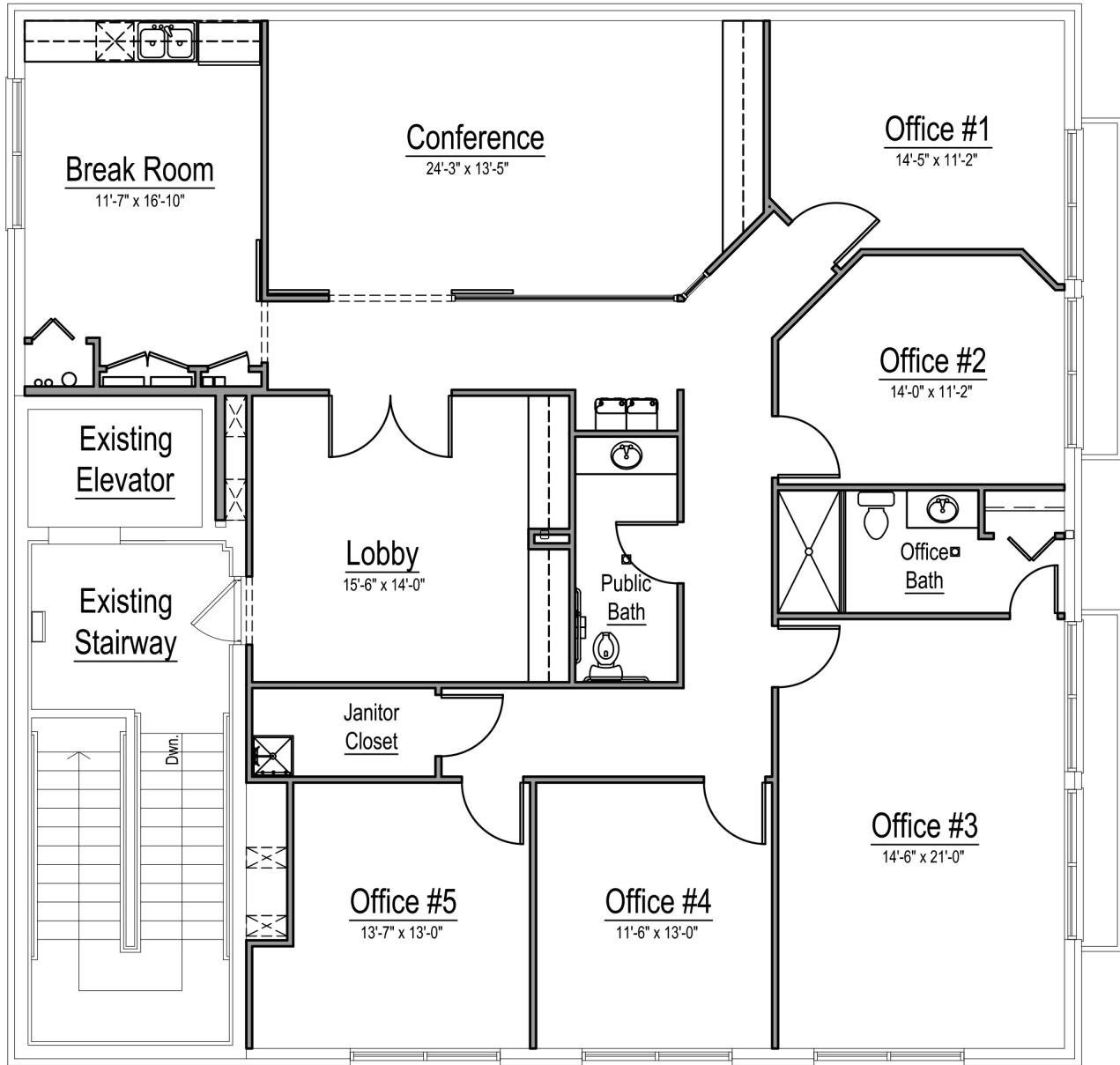
Lease Floor Plan 2,640 SQ. FT.

Matching the right people to the right place.