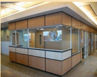
Hospital Admissions Center