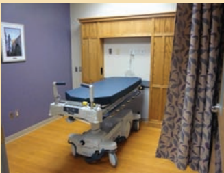
Pre-Op Holding Room