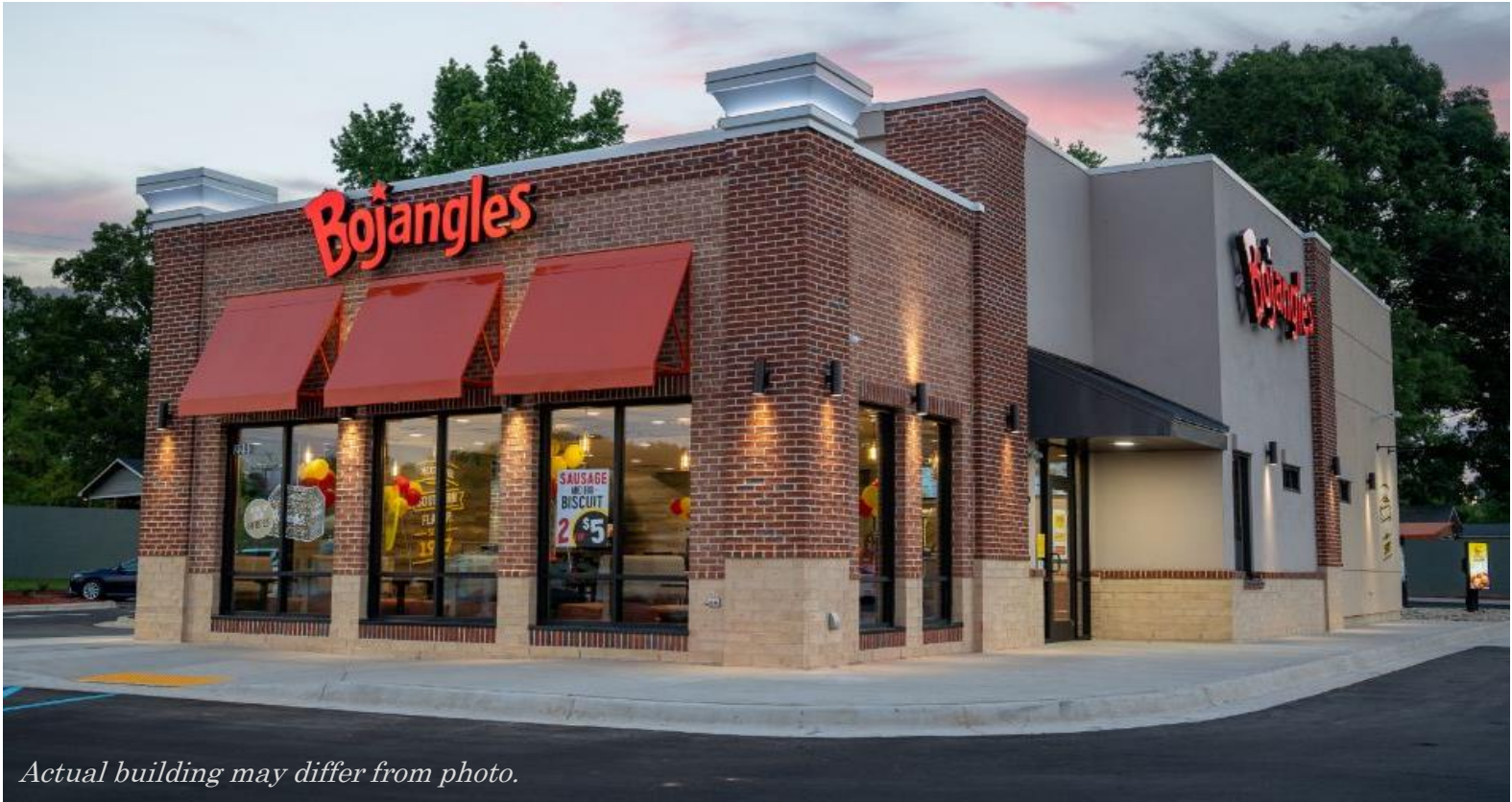
Actual building may differ from photo.