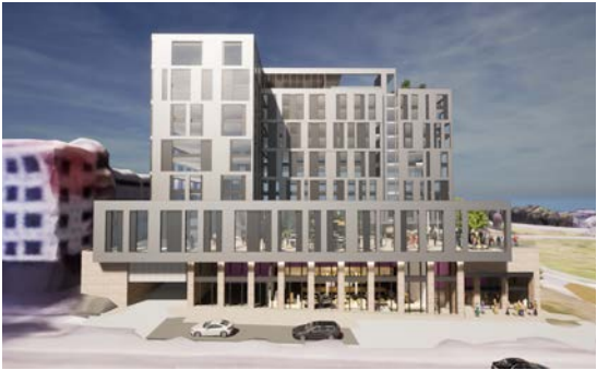
408 WOODLAND ST