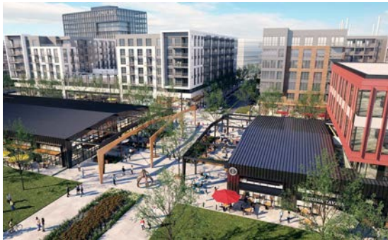
PSC METALS REDEVELOPMENT