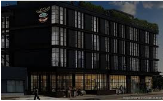
SOUTHERN LAND CO. / LINCOLN TECH REDEVELOPMENT