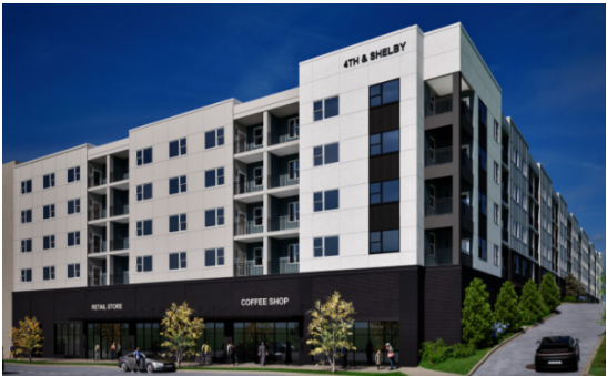
4TH & SHELBY