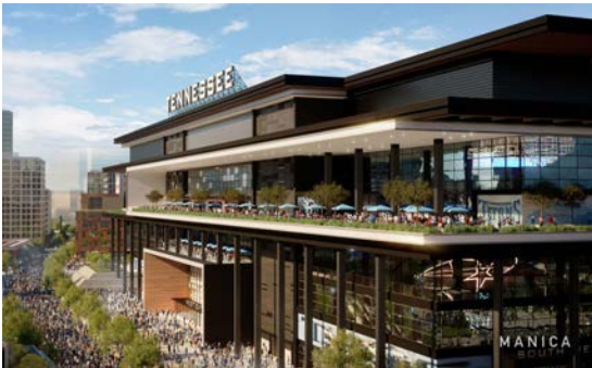
NEW TITANS STADIUM