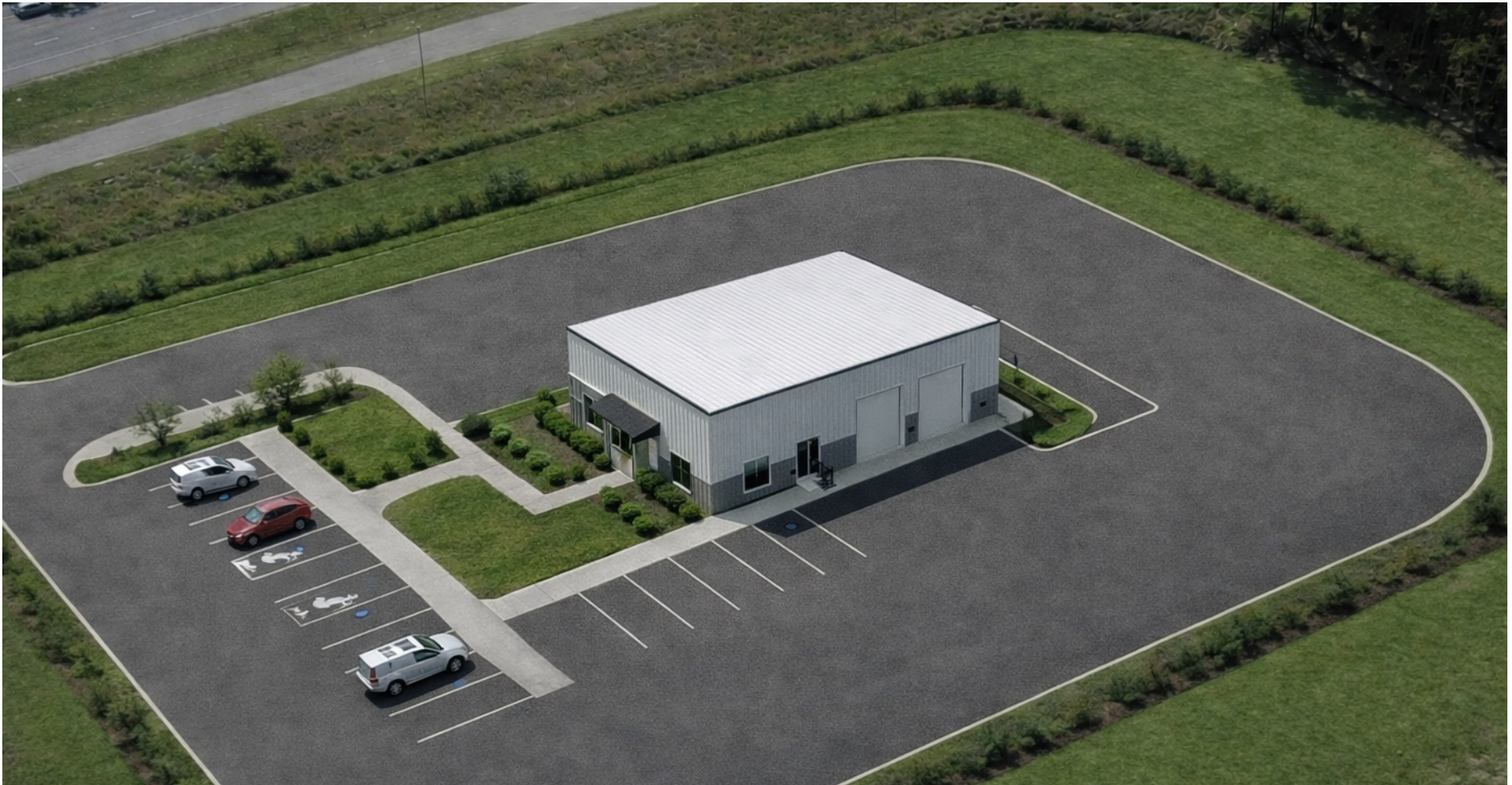
Representative Rendering - Not to Scale