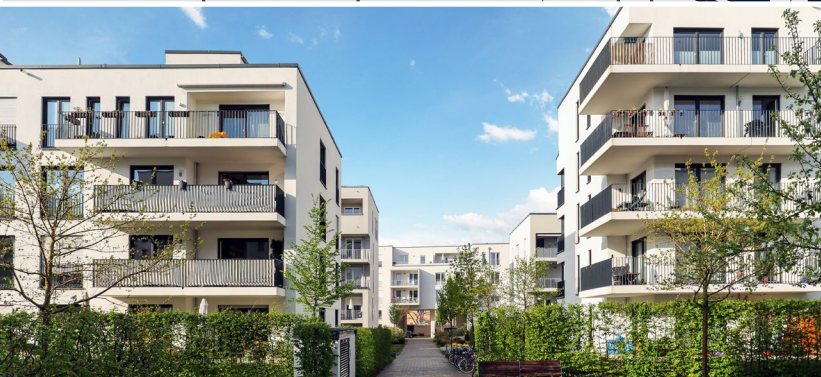
Residential Developments Underway