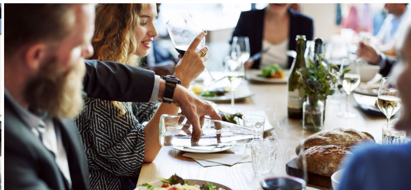
Hundreds of Dining Options Nearby