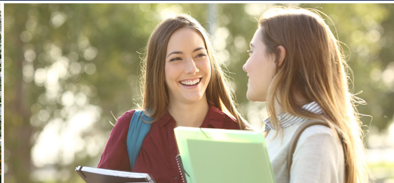
Adjacent to Nova Southeastern University