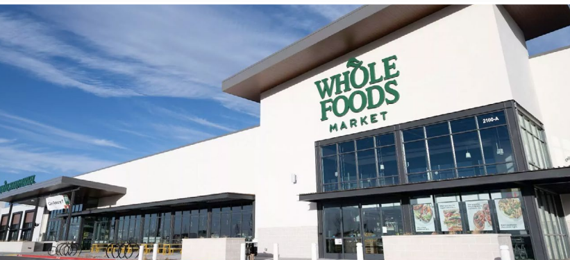
Whole Foods Market Down The Street