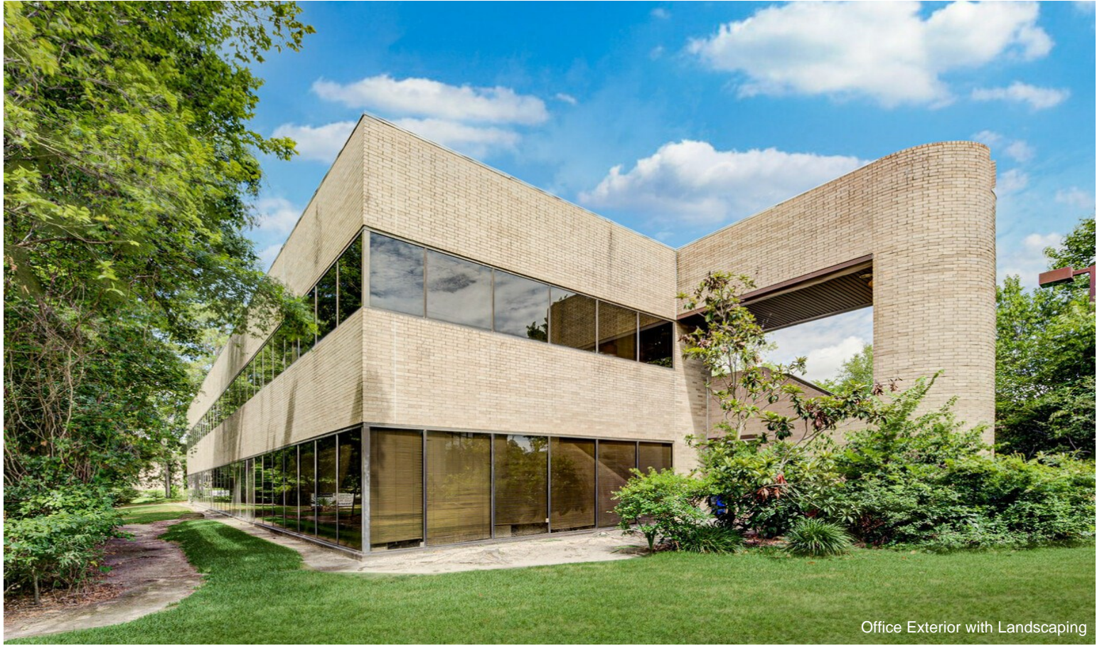
Office Exterior with Landscaping