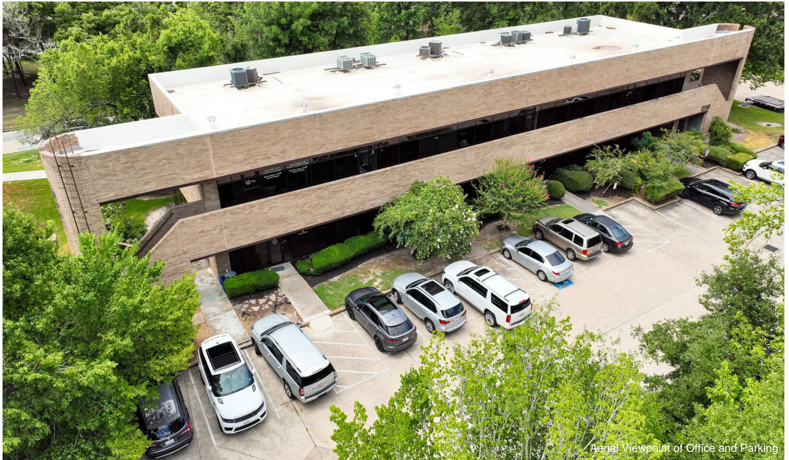
Aerial Viewpoint of Office and Parking