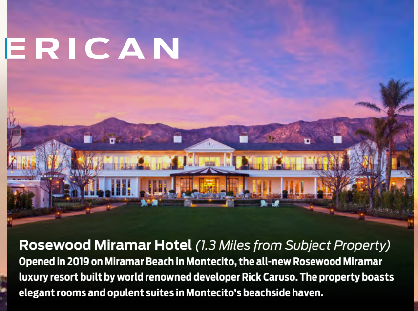
Rosewood Miramar Hotel (1.3 Miles from Subject Property) Opened in 2019 on Miramar Beach in Montecito, the all-new Rosewood Miramar luxury resort built by world renowned developer Rick Caruso. The property boasts elegant rooms and opulent suites in Montecito’s beachside haven.

Montecito is home to many world class restaurants and shopping as well some of Santa Barbara’s most stunning stretches of coastline and mountainous trailheads. It encompasses a total of eight square miles and comprises the Upper and Lower villages. The Mediterranean-style architecture, beautiful scenery and year-round sunshine is about as idyllic as you can get. It is conveniently situated five-minutes from downtown Santa Barbara and Los Angeles is about an hour by car. Travel + Leisure magazine named Montecito one of its “50 Best Places to Travel” in 2019.