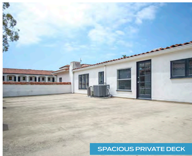
SPACIOUS PRIVATE DECK