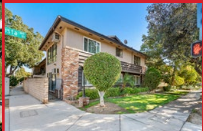
112 N MAR VISTA AVE