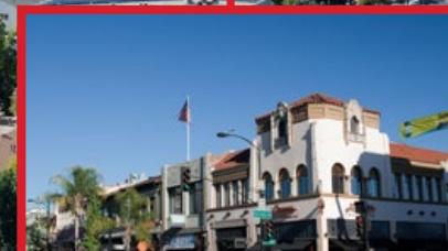
OLD TOWN PASADENA