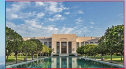
PASADENA CITY COLLEGE