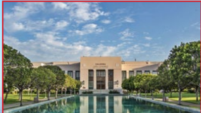
PASADENA CITY COLLEGE