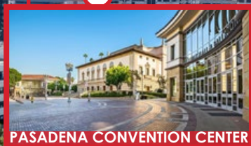
PASADENA CONVENTION CENTER