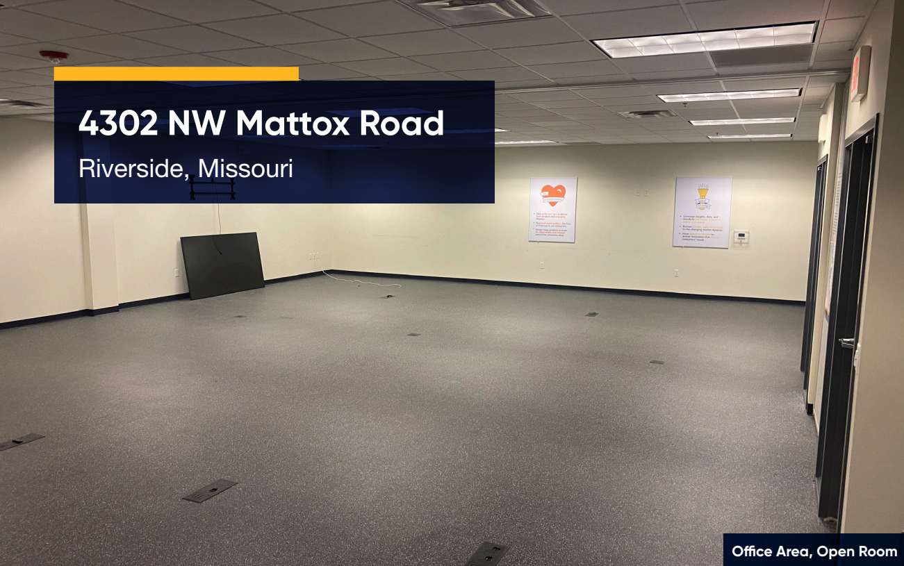
Office Area, Open Room