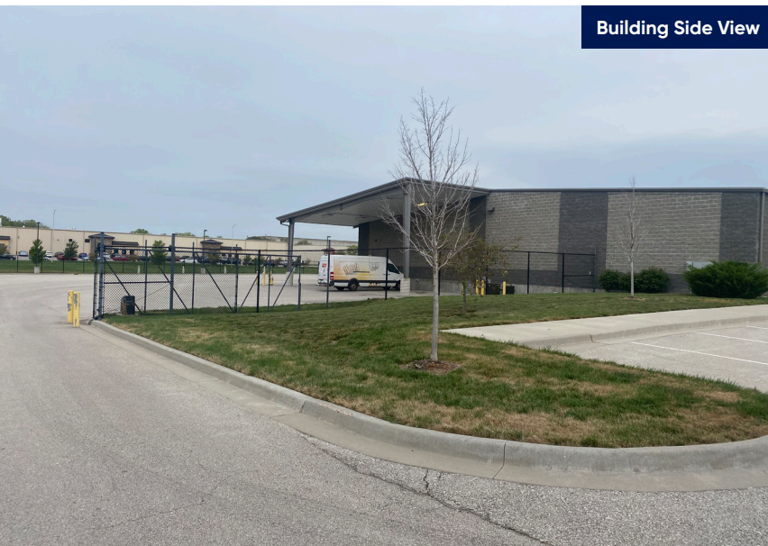
Building Side View