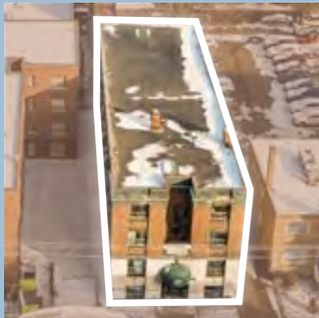
383 SHERBOURNE STREET Building Area: 13,981 SF

387 Sherbourne Street, currently comprising 44 units, has been approved for demolition to facilitate the development of a 39-storey residential tower. The redevelopment will replace all 44 units, including 27 units secured at affordable rents ( \leq 1.0\times CMHC AMR), achieving $4.07 PSF due to compact unit sizing. The remaining 17 units may be leased at market rental rates. The companion building at 383 Sherbourne Street will be retained and renovated, preserving 32 existing rental units.