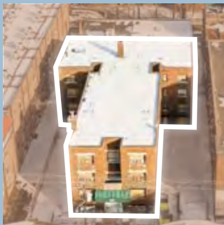
387 SHERBOURNE STREET Gross Floor Area: 19,631 SF