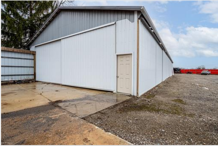
View of pole building