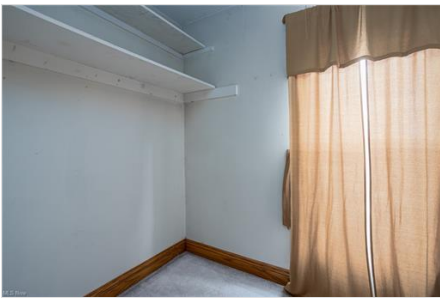
Spacious closet featuring carpet