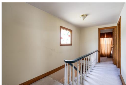
Corridor with light carpet, baseboards, and an upstairs landing