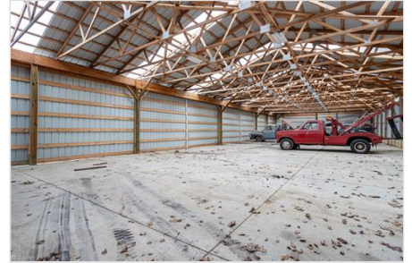
Garage featuring metal wall