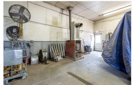
View of garage