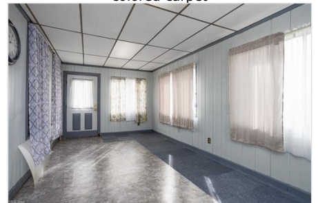
Unfurnished room with a drop ceiling, tile patterned floors, and baseboards