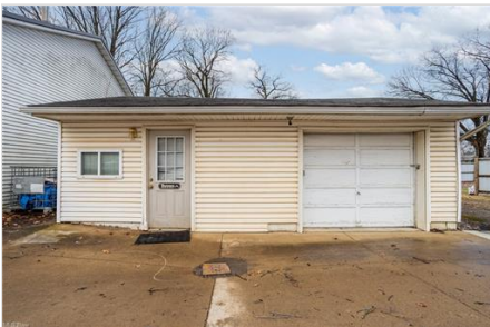
Garage with concrete driveway