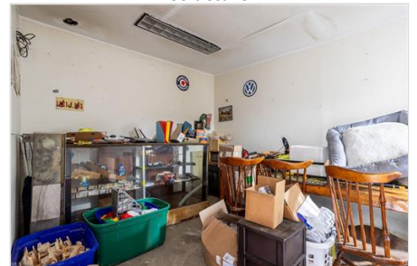
View of misc room