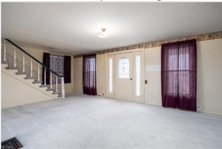
Carpeted entrance foyer with stairway