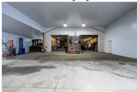
Garage featuring metal wall