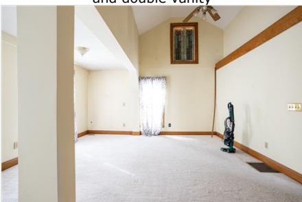
Bonus room featuring high vaulted ceiling, carpet, visible vents, and baseboards