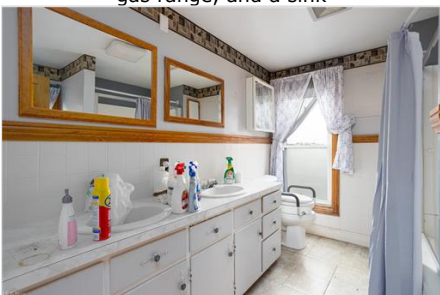
Bathroom featuring a sink, tile walls, toilet, and double vanity