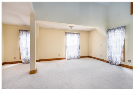
Carpeted spare room with baseboards