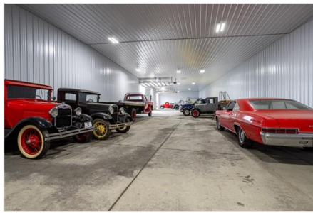
Garage with metal wall