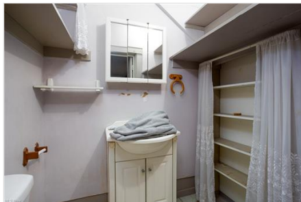
Half bath with vanity and toilet