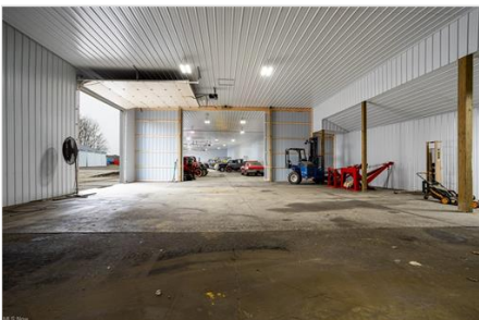
Garage with metal wall