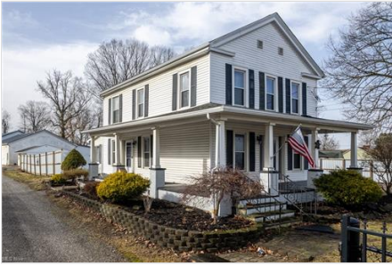
View of front of home featuring fence and a porch