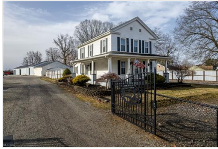
View of front of house with a porch and fence