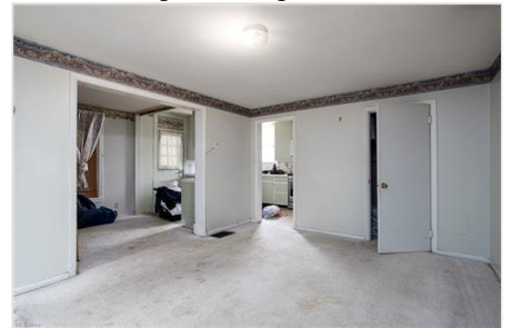
Spare room featuring baseboards and light colored carpet