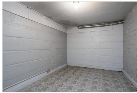
View of unfinished below grade area