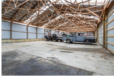
Garage featuring metal wall