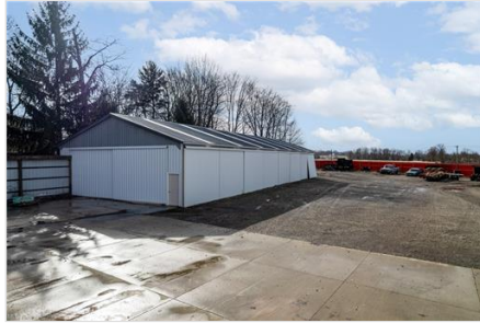
View of outbuilding featuring an outbuilding