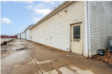
View of home's exterior