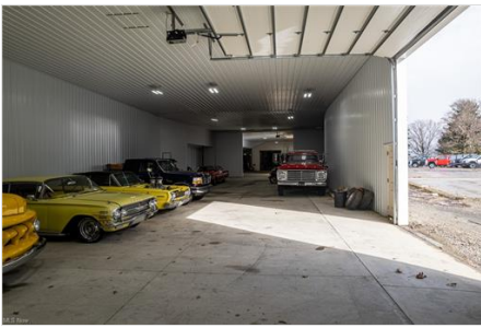
Garage featuring metal wall