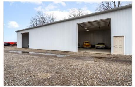
View of pole building