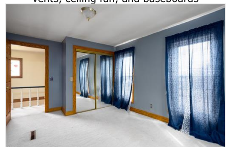
Bedroom featuring carpet floors, a closet, visible vents, and baseboards