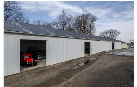
View of side of property featuring a pole building, metal roof, and an outdoor structure