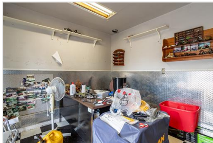
Misc room featuring a wainscoted wall and tile patterned floors