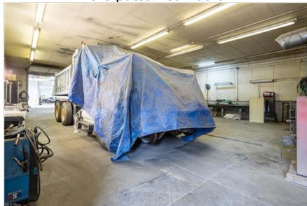
View of garage