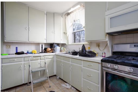
Kitchen with tasteful backsplash, tile counters, white microwave, stainless steel gas range, and a sink