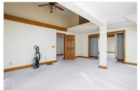
Below grade area with carpet floors, visible vents, ceiling fan, and baseboards