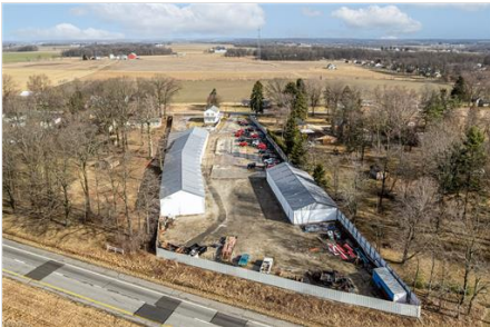
Aerial view featuring a rural view