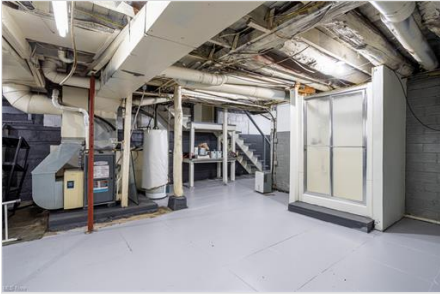
Unfinished basement with stairs, gas water heater, and heating unit

Information is Believed To Be Accurate But Not Guaranteed