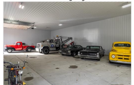
Garage with metal wall