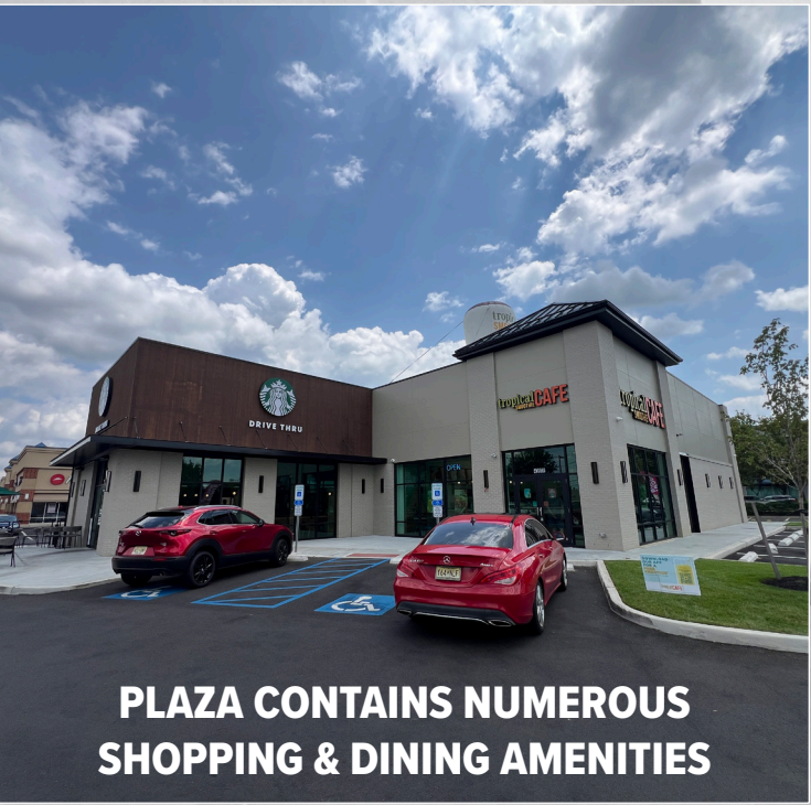
PLAZA CONTAINS NUMEROUS SHOPPING & DINING AMENITIES