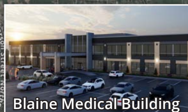
Blaine Medical Building