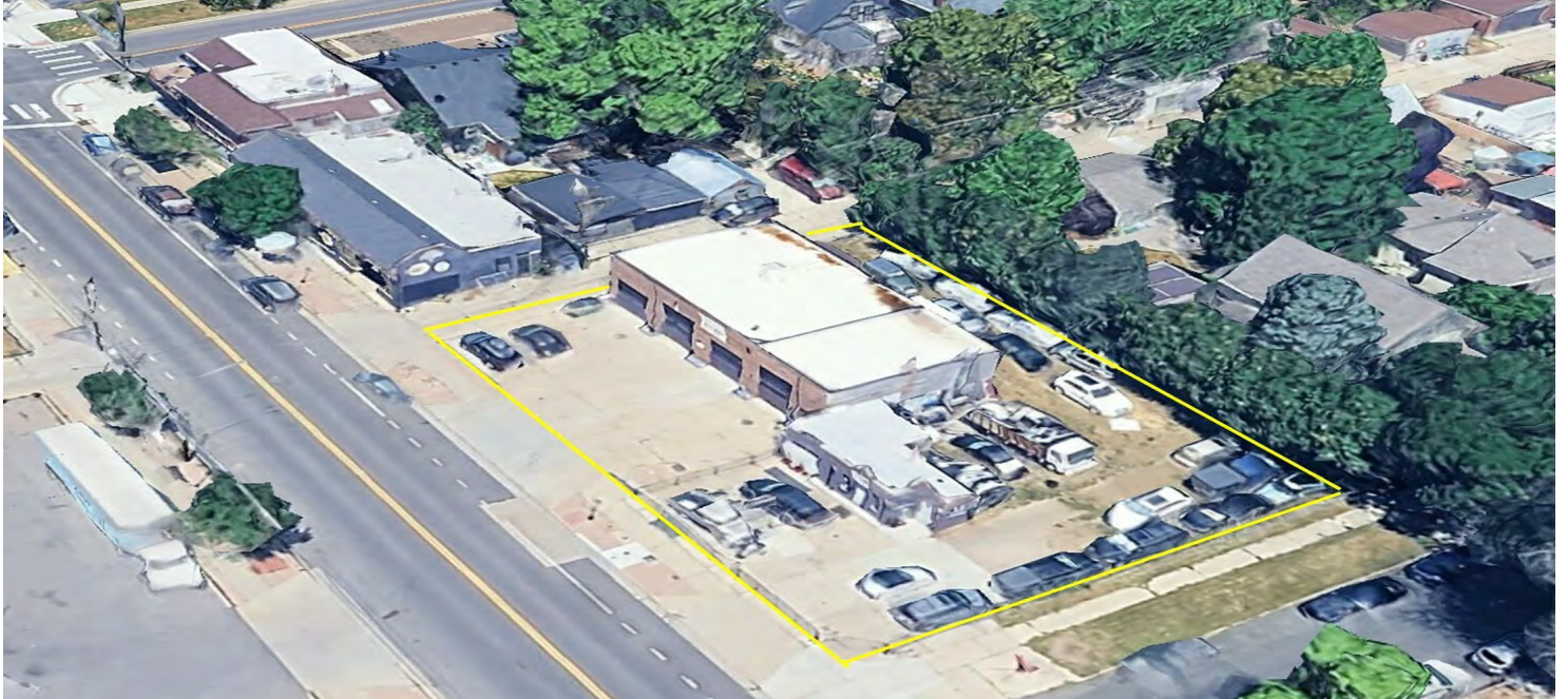
Concrete Lot 4 Bay Automotive