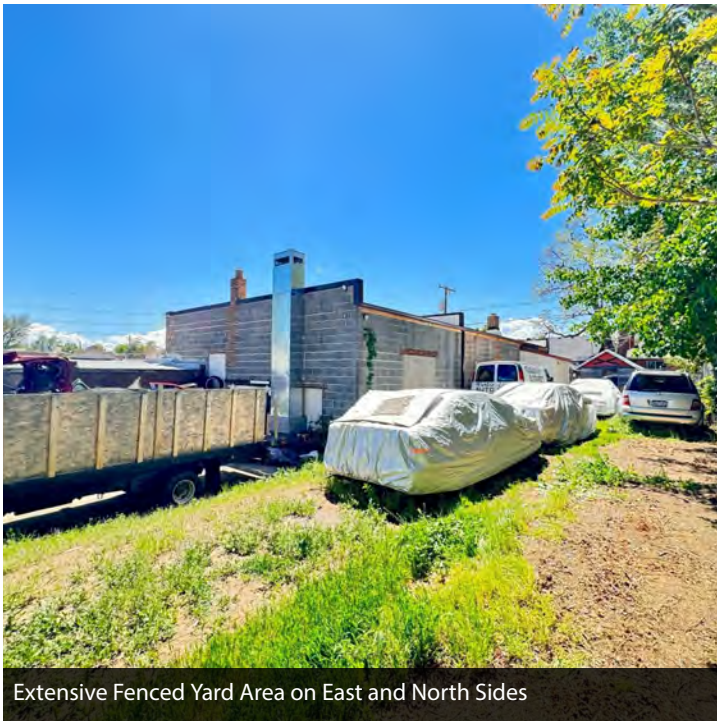
Extensive Fenced Yard Area on East and North Sides