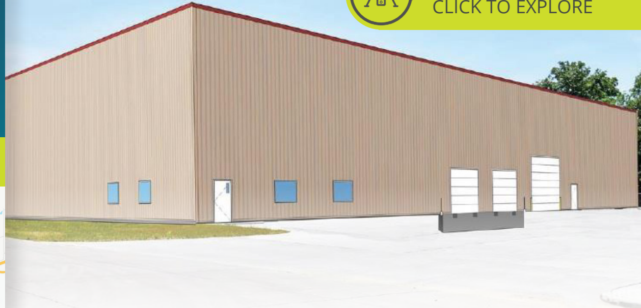
Sample Building Rendering