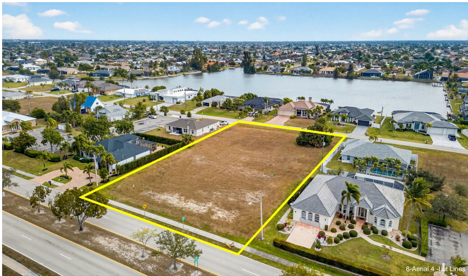
8-Aerial 4 -Lot Lines