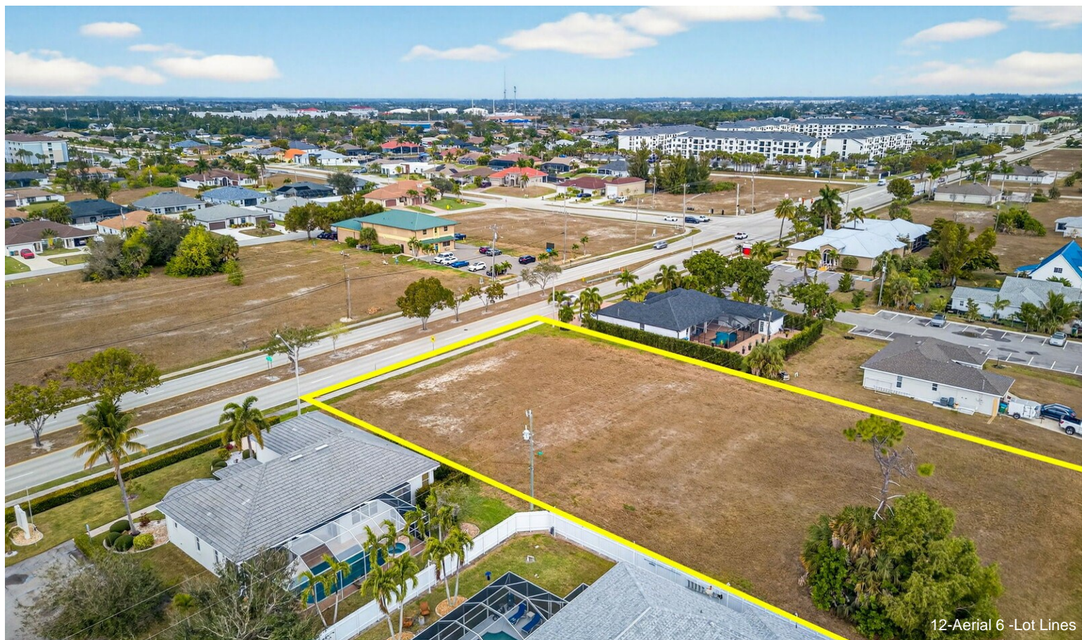
12-Aerial 6 -Lot Lines