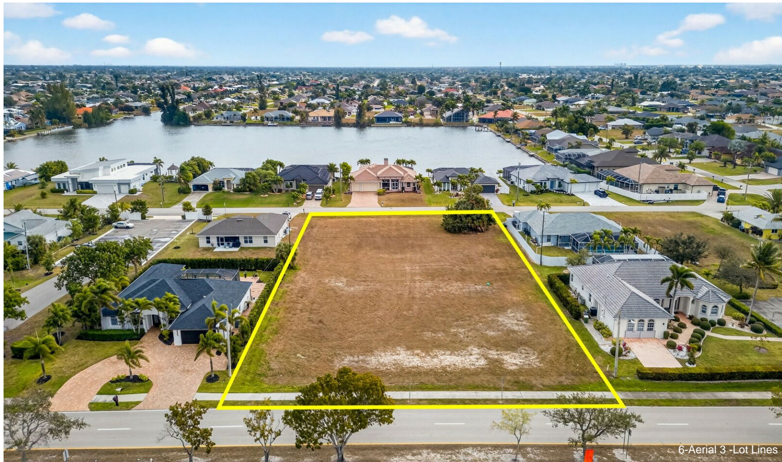
6-Aerial 3 -Lot Lines