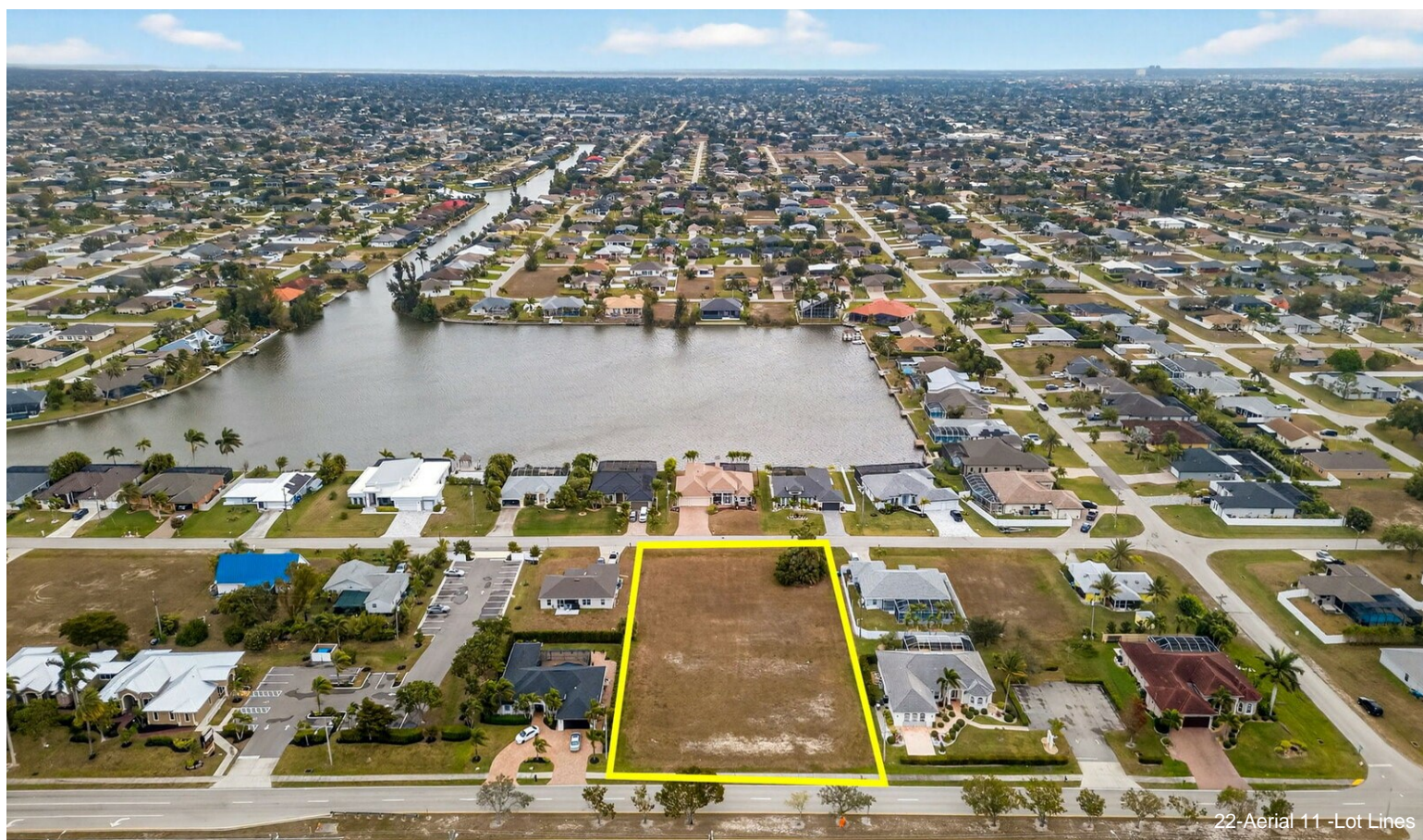
22-Aerial 11 -Lot Lines