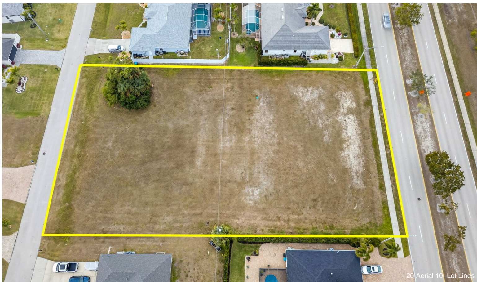
20-Aerial 10 -Lot Lines