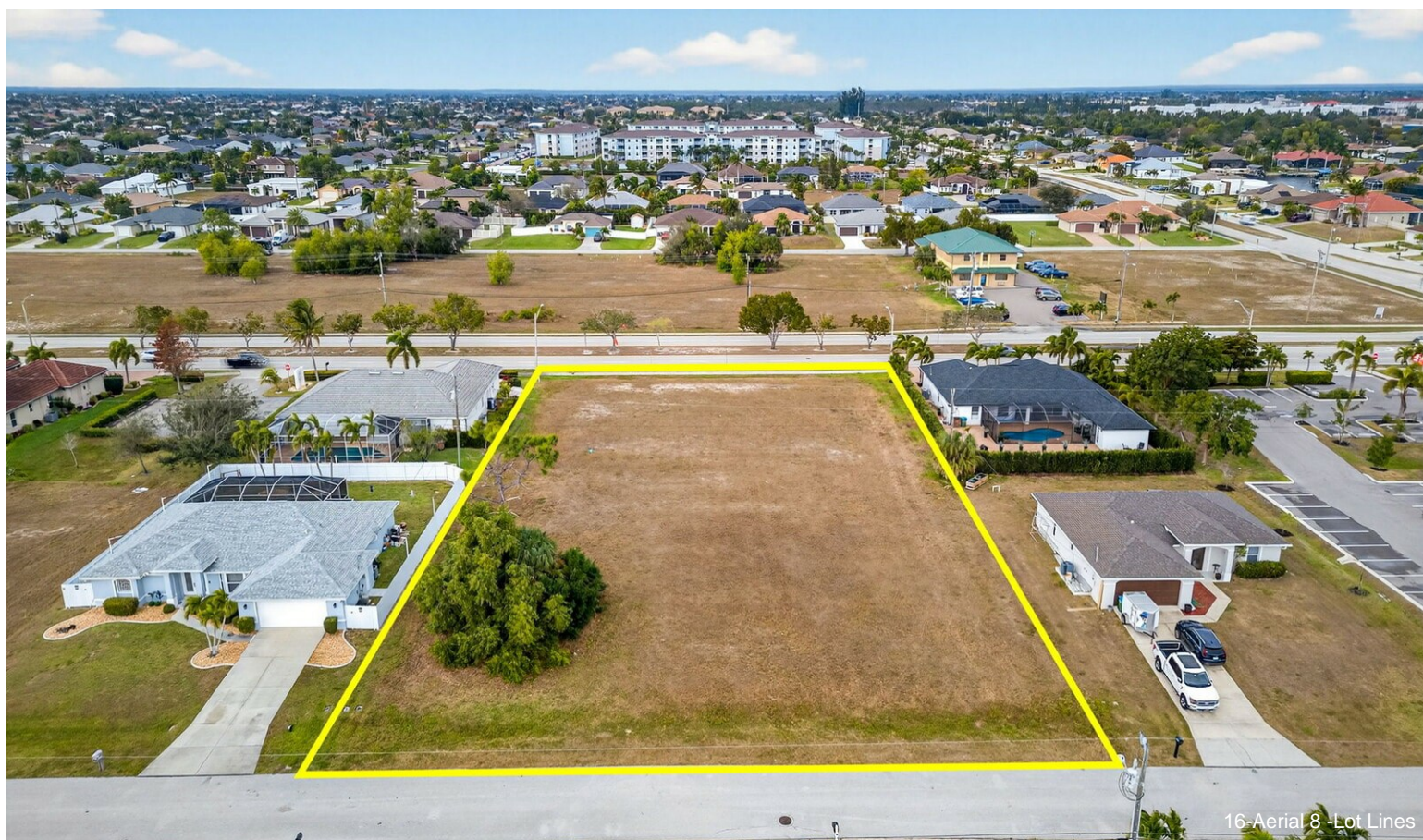
16-Aerial 8 -Lot Lines