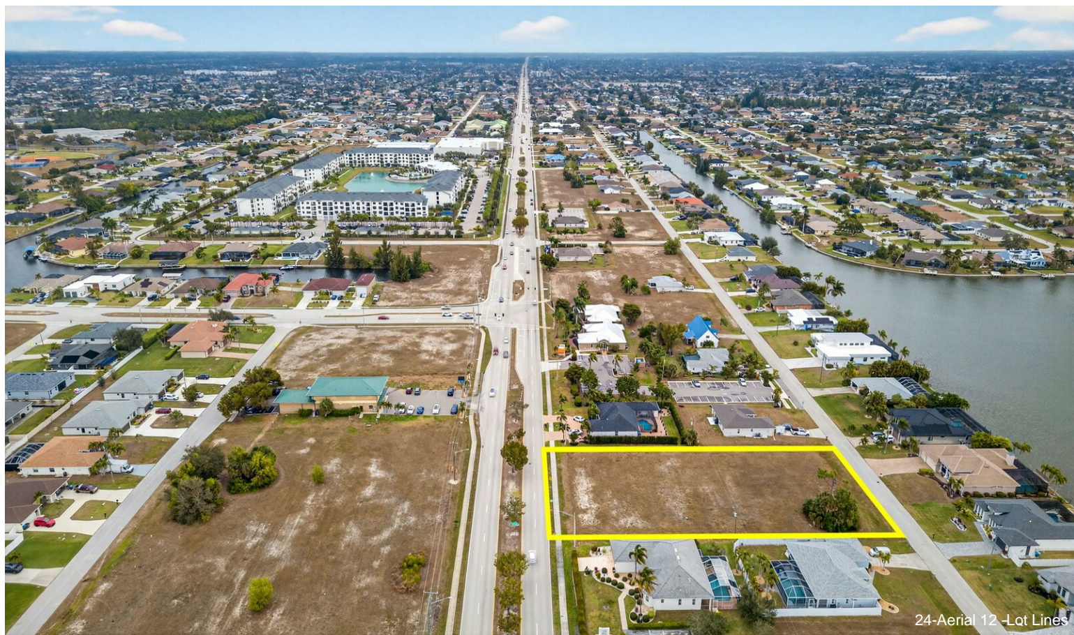
24-Aerial 12 -Lot Lines