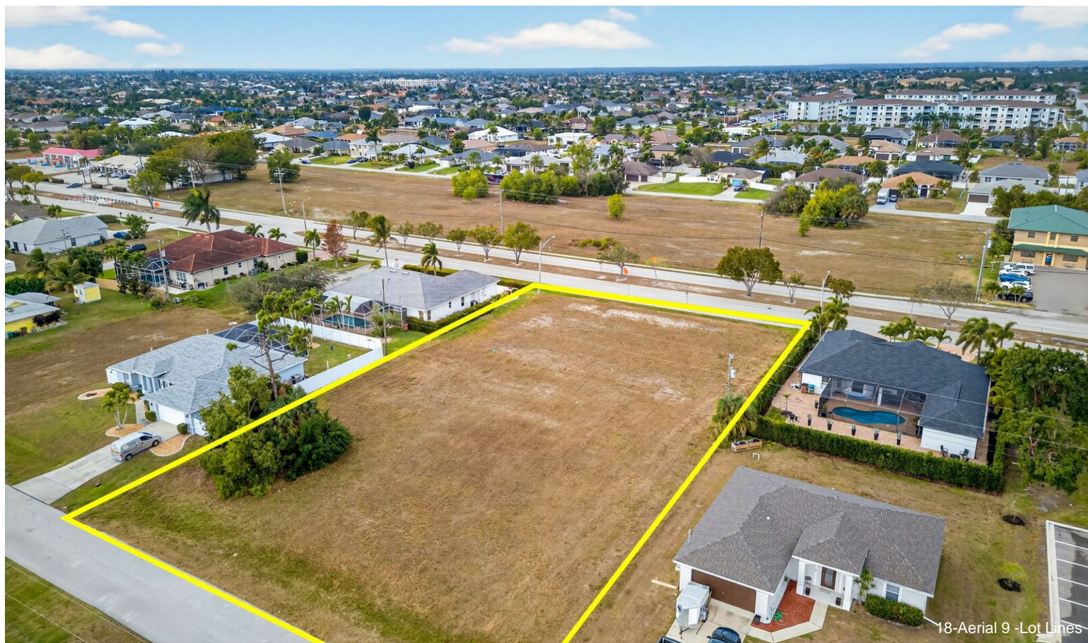
18-Aerial 9 -Lot Lines