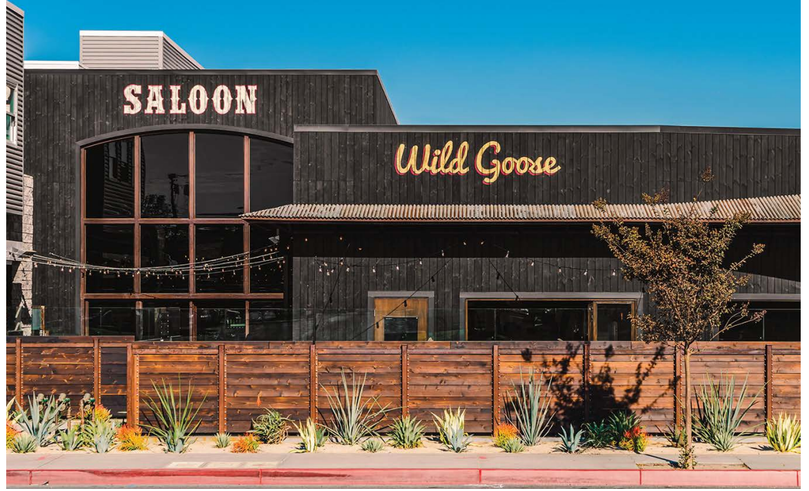
WILD GOOSE TAVERN