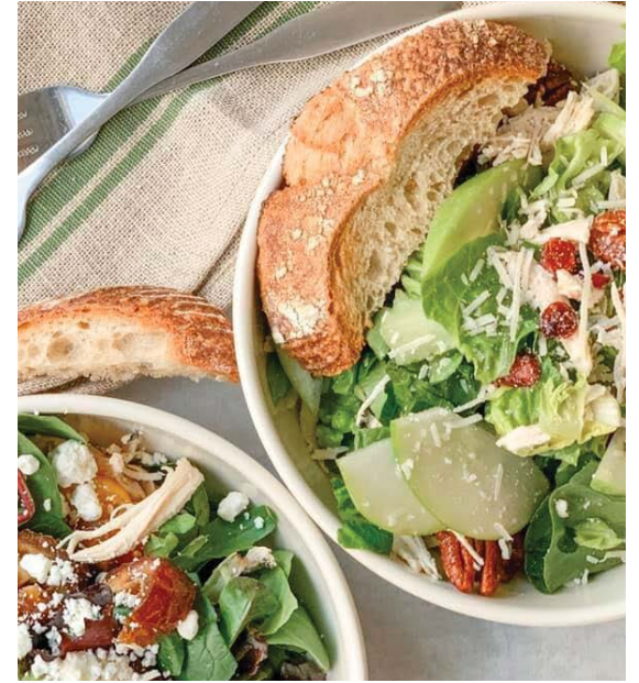
HAUTE CAKES CAFE