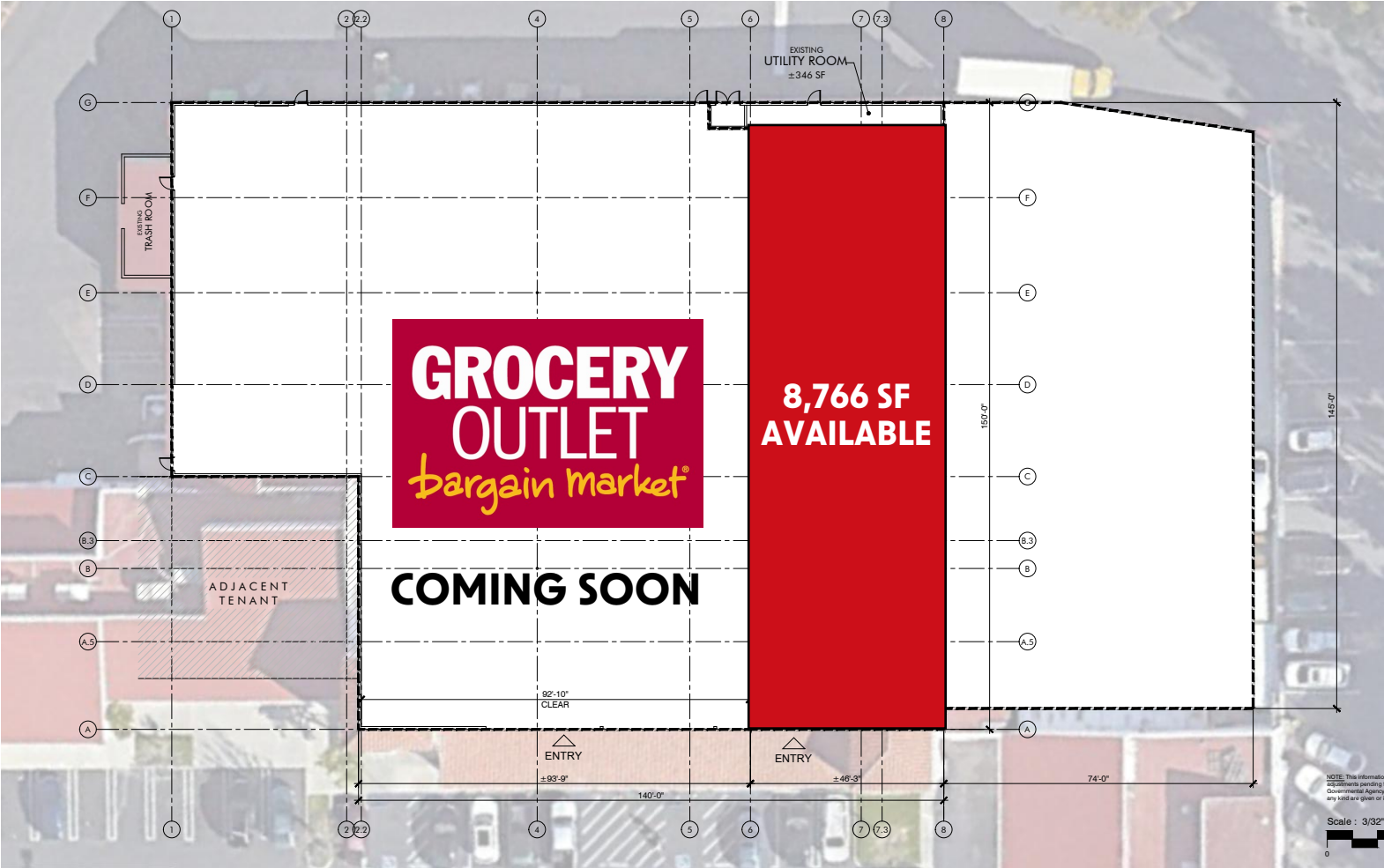
PROPOSED DEMISING PLAN

99 VIA PICO PLAZA - 99 CENT SAN CLEMENTE, CA