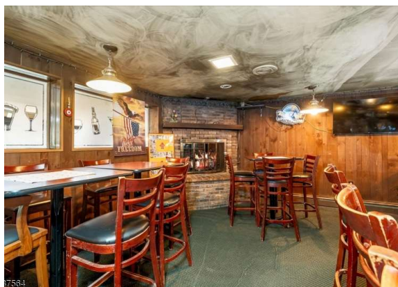
BAR SEATING AREA