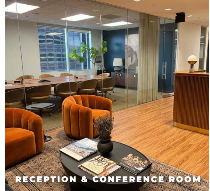
RECEPTION & CONFERENCE ROOM