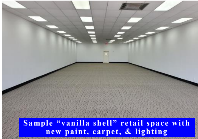
Sample "vanilla shell" retail space with new paint, carpet, & lighting