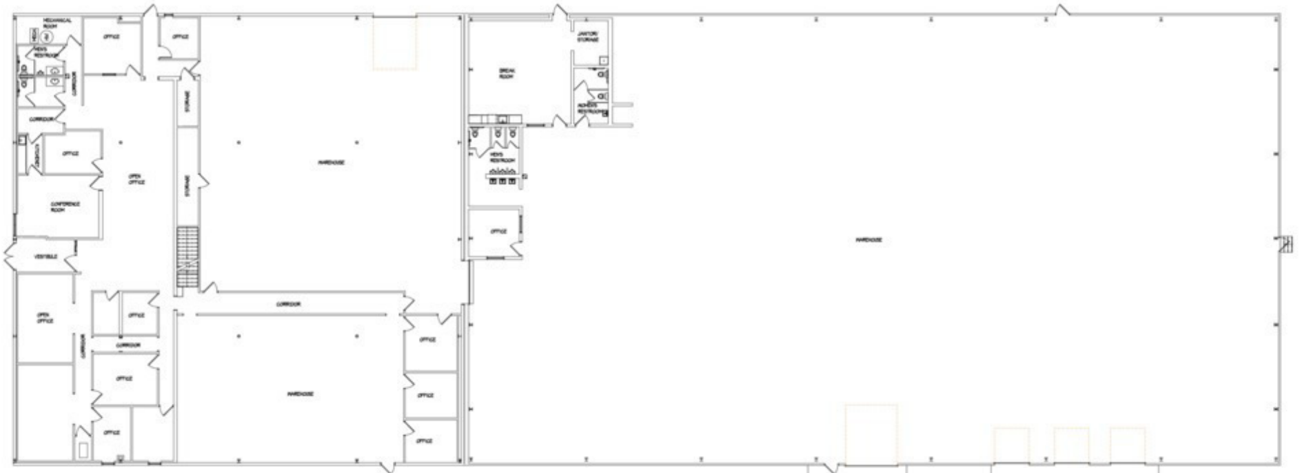
FLOOR PLAN, FIRST FLOOR SCALE - NOT TO SCALE