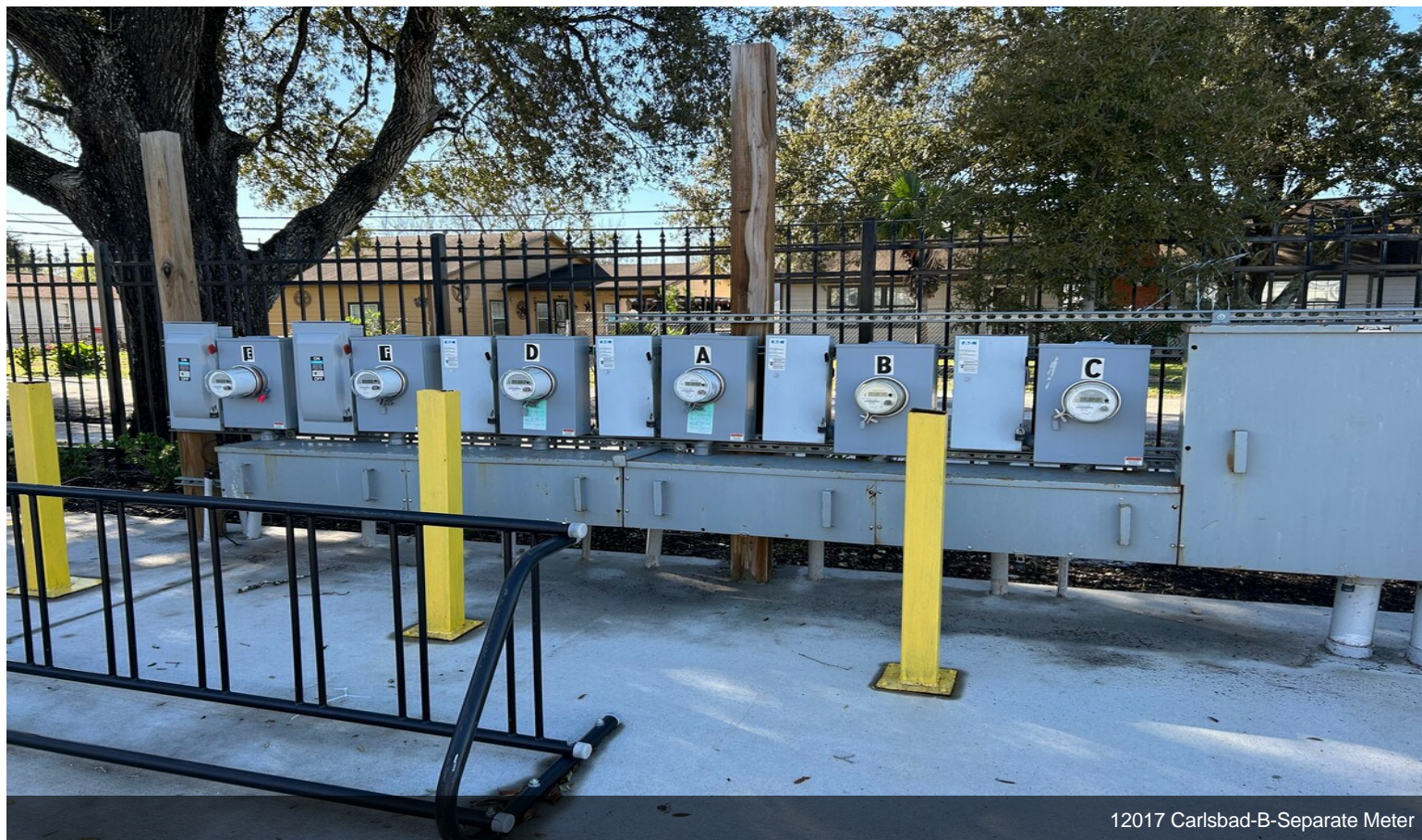
12017 Carlsbad-B-Separate Meter