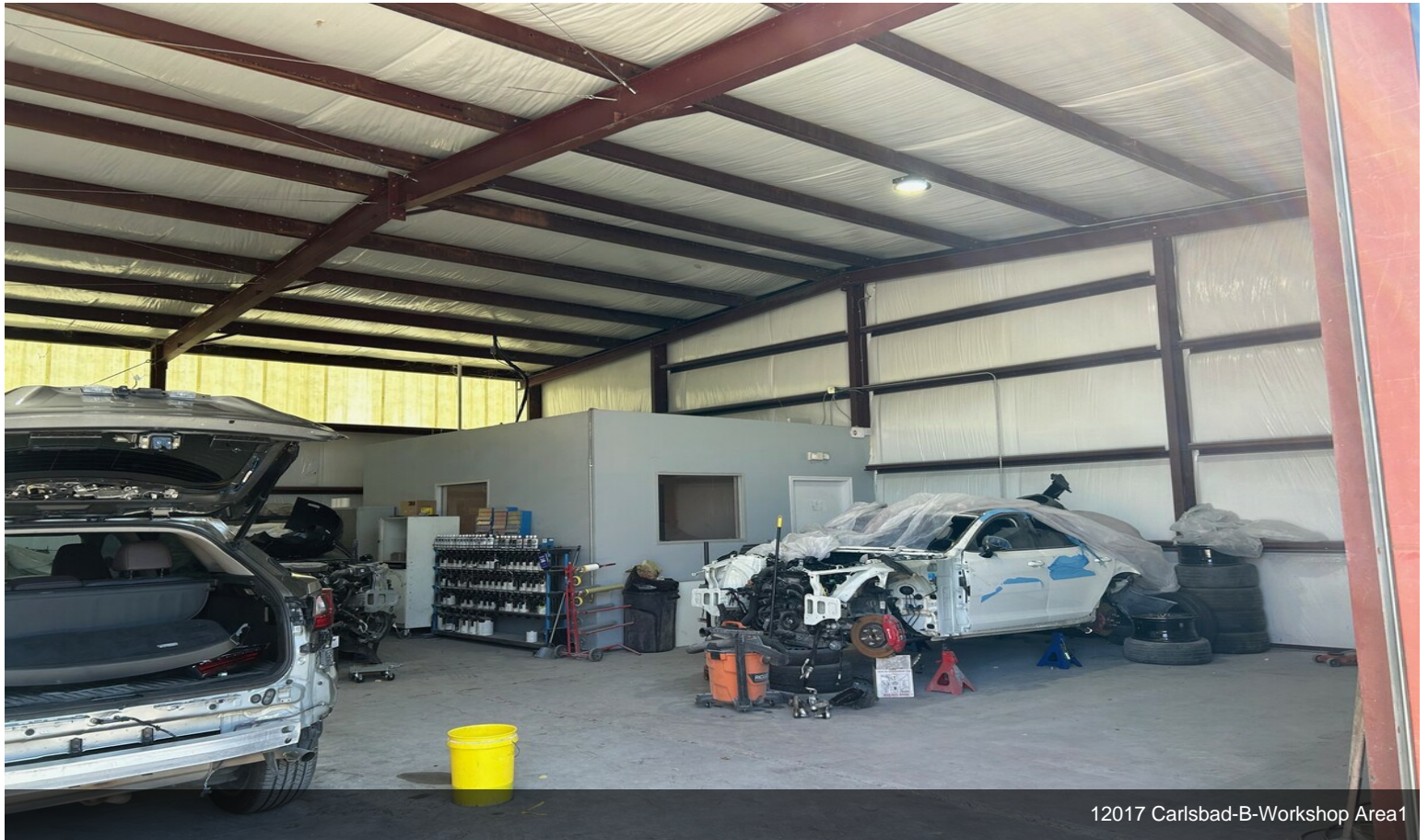
12017 Carlsbad-B-Workshop Area1