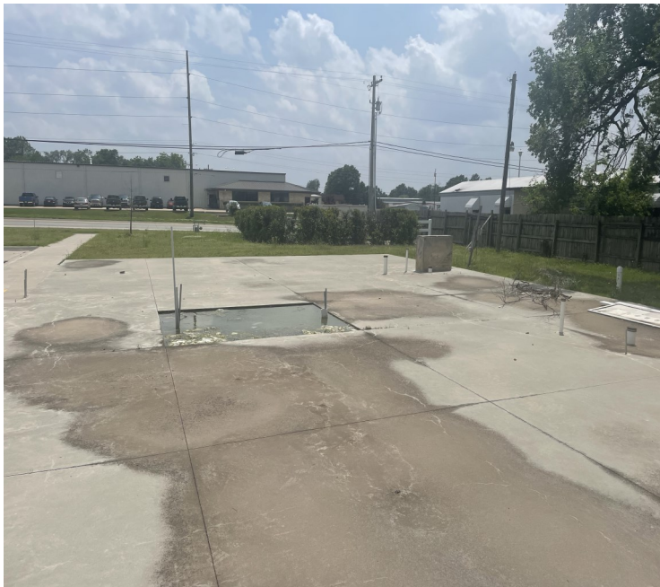
Building Pad for proposed 2-story office building