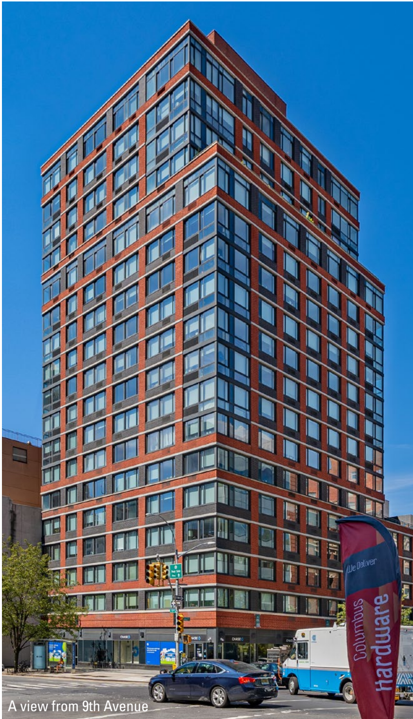
A view from 9th Avenue