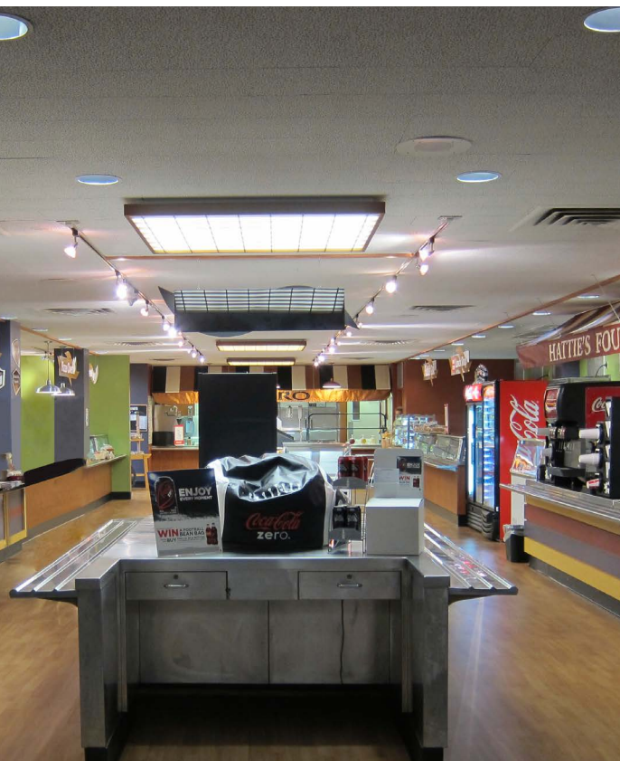
Top-notch service at the fresh new Canal Commons Café & Eatery

The classic appearance of wood and stone has been preserved within the walls of these 8 historic buildings while a contemporary new look and feel has been created utilizing glass and stainless steel. The abundance of natural light and terrific views through the large windows pair well with the adaptable floor plan layouts.