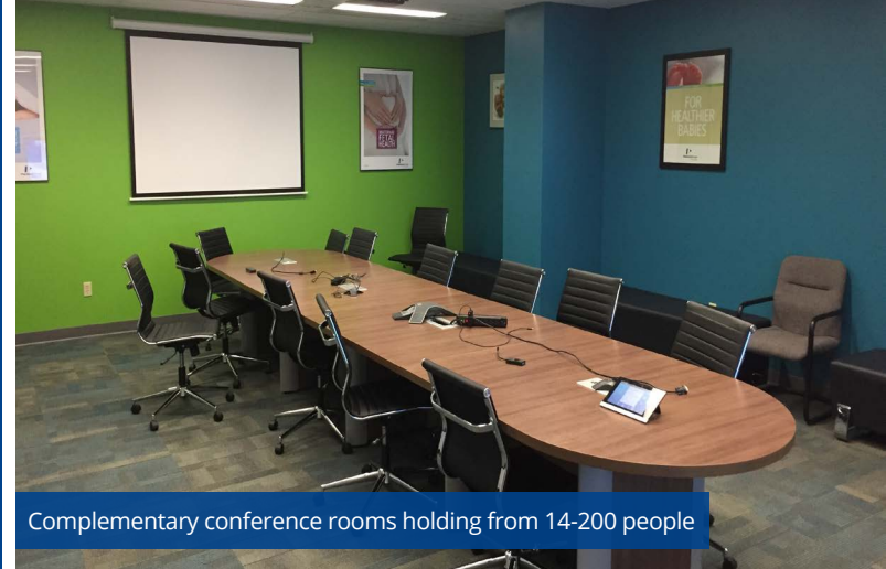
Complementary conference rooms holding from 14-200 people