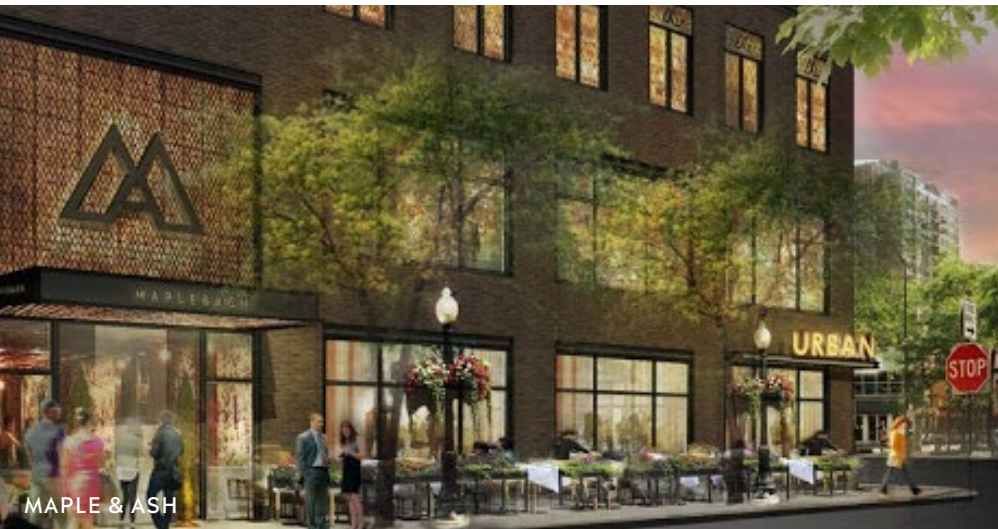
MAPLE & ASH