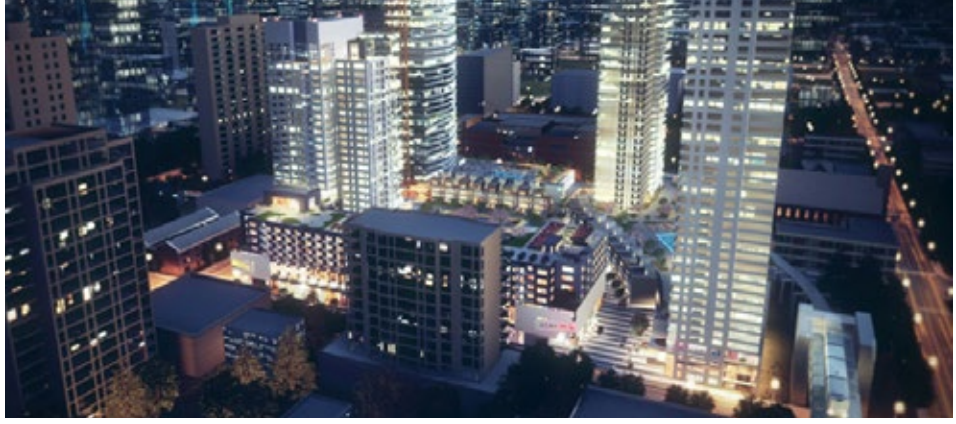
ATRIUM VILLAGE URBAN RENEWAL PROJECT 1,500 residential units and 47,000 SF retail