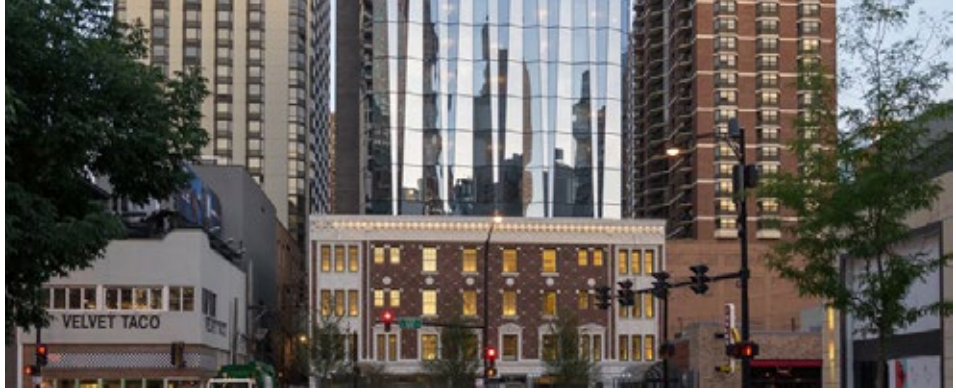
THE VICEROY HOTEL 180 room boutique hotel