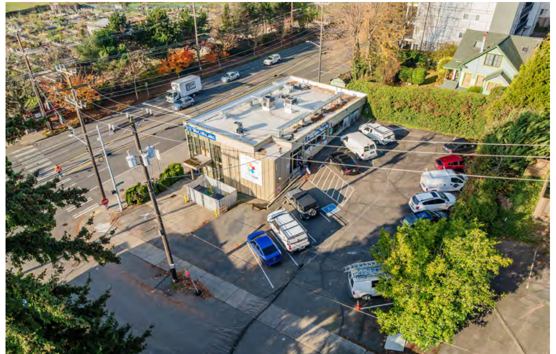
2500 15th Ave W, Seattle, WA