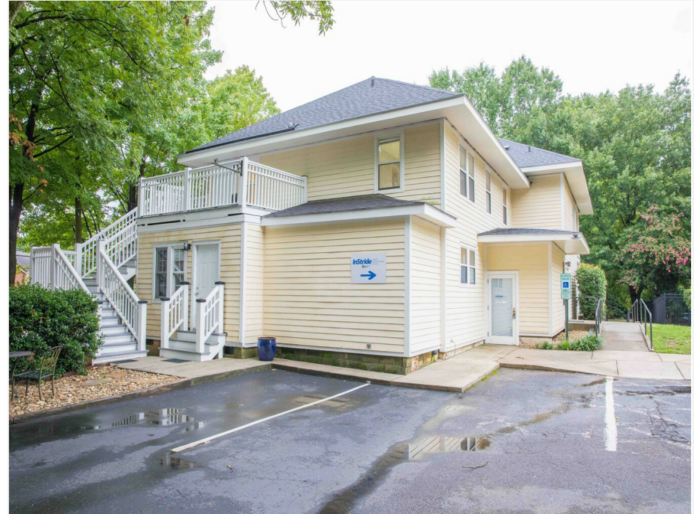
Back Entry with Parking