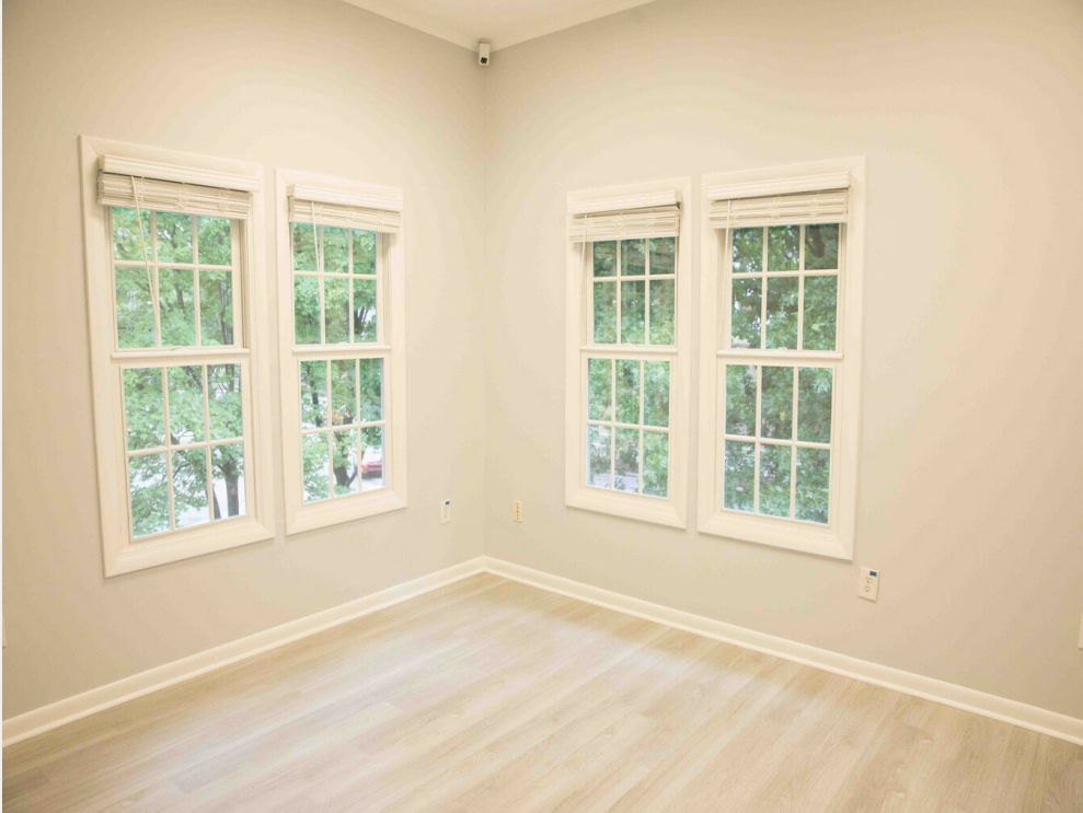
Office Example, Windows