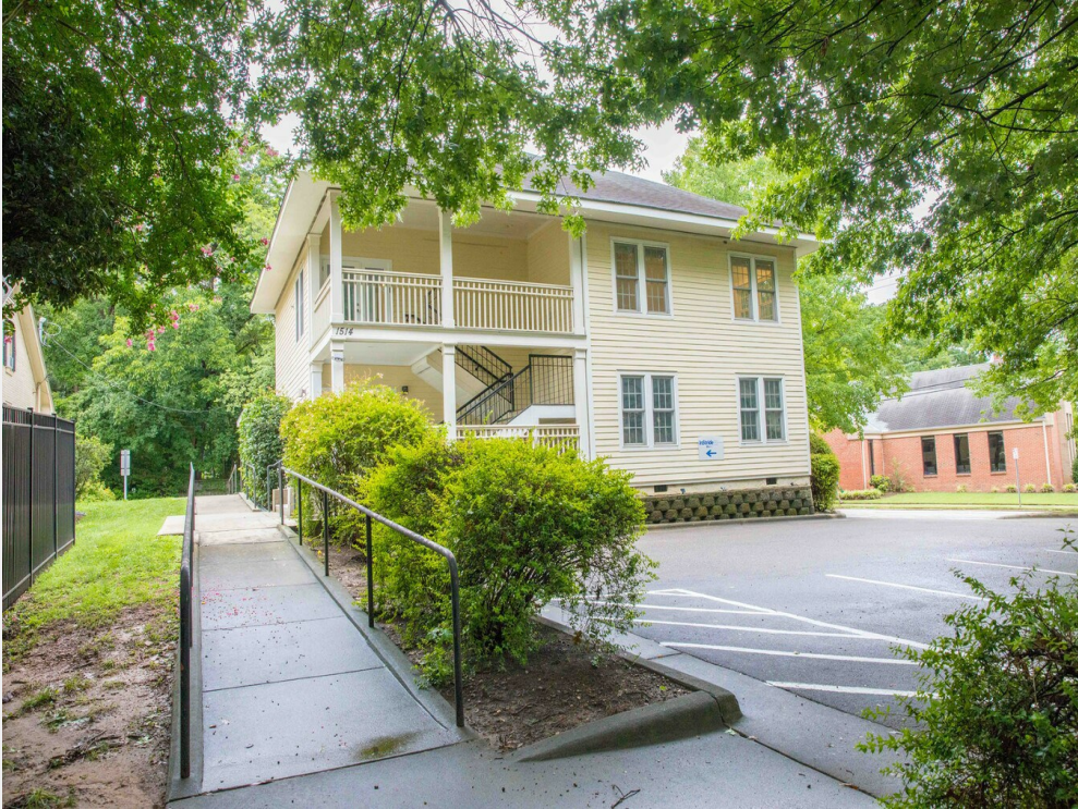
Front Entry with Parking