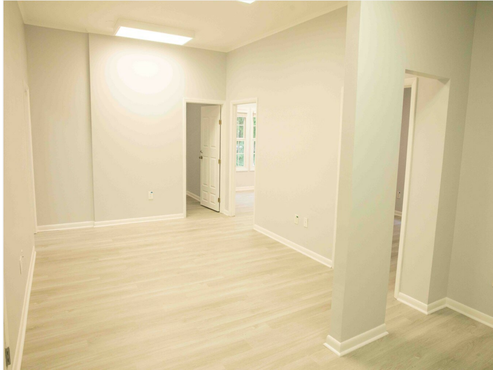
Elevated Ceilings, Front Office Space