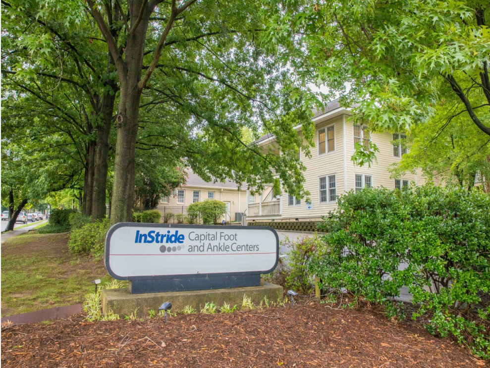
Glenwood Ave Signage