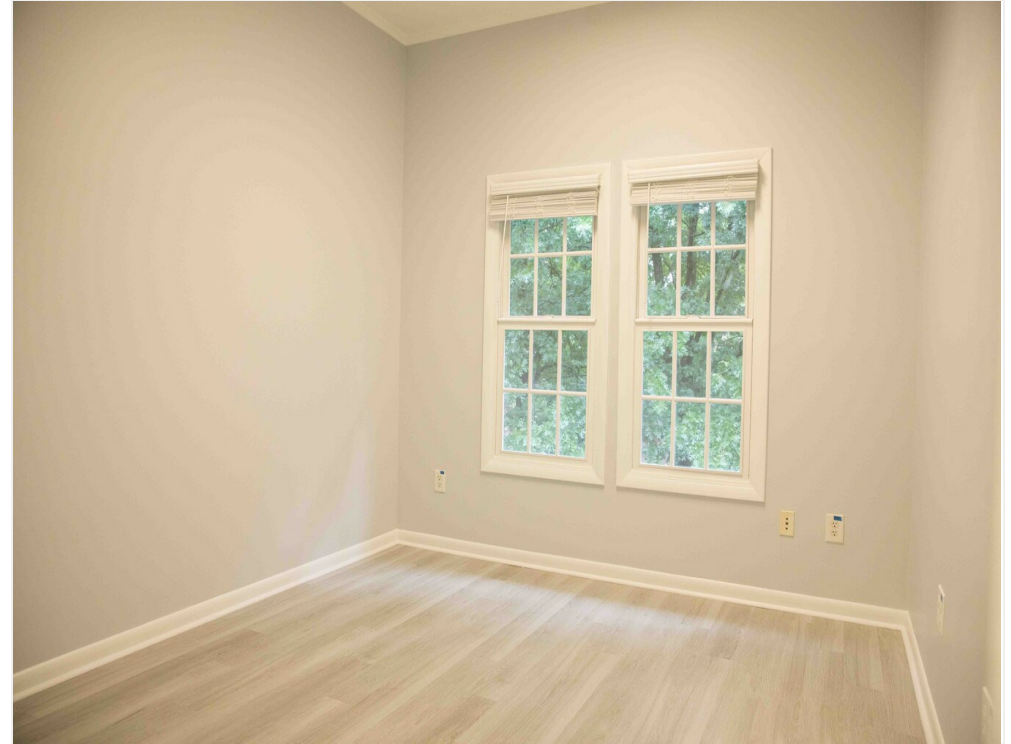
Office Example, Windows