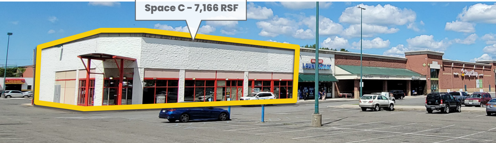
Space C - 7,166 RSF