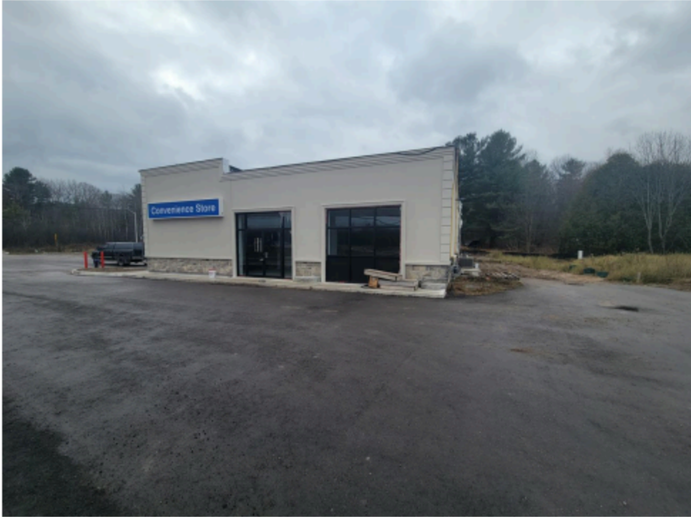
Convenience Store Building