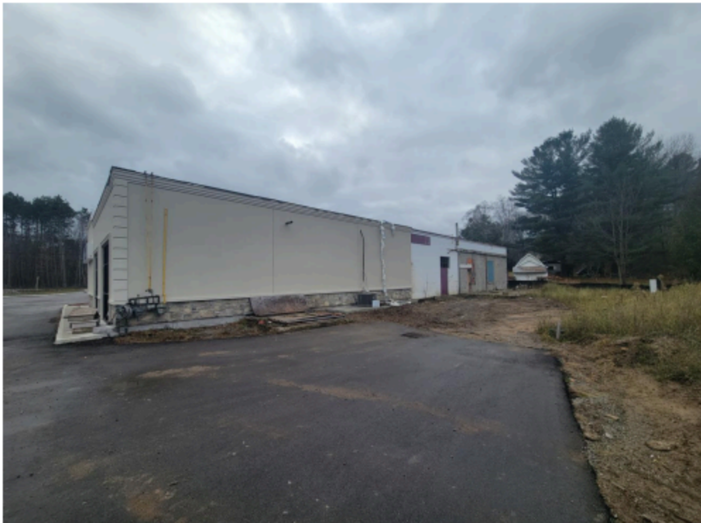
Convenience Store Building Side