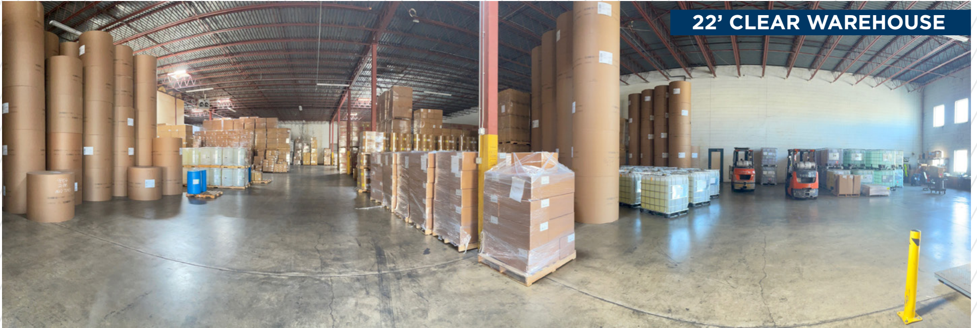
22' CLEAR WAREHOUSE