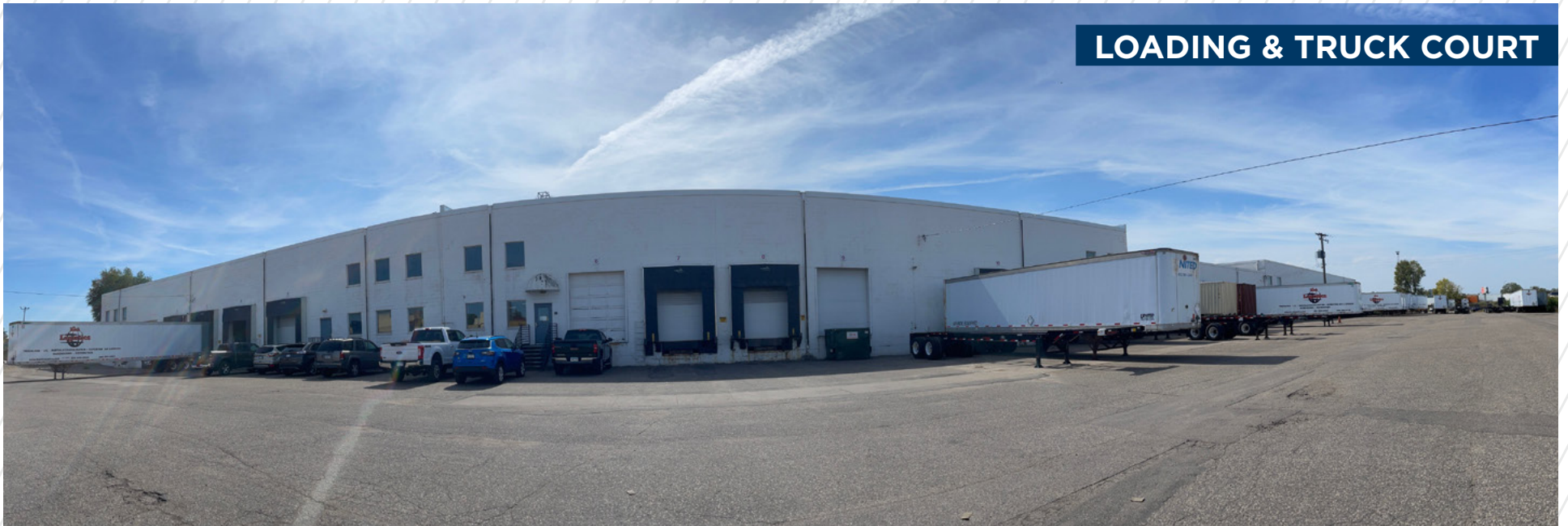
LOADING & TRUCK COURT