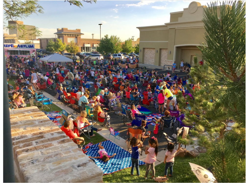
WS movie night