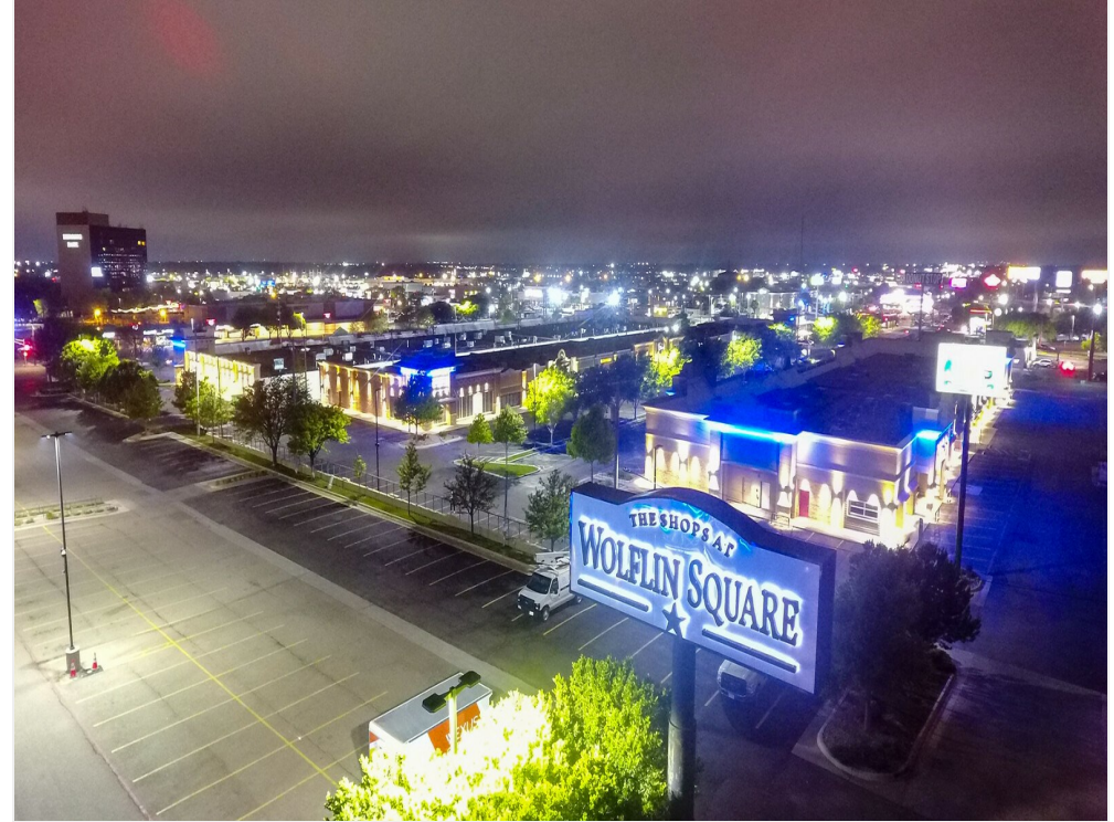
ws night 5