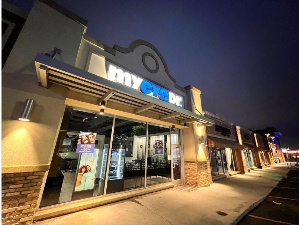
ws night 10