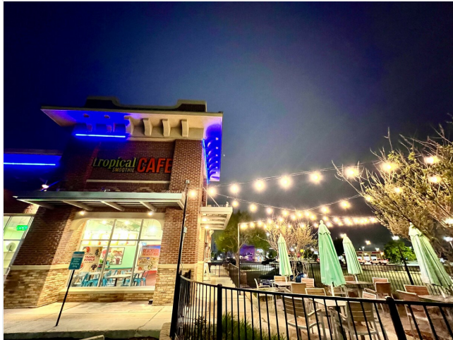
ws night 14