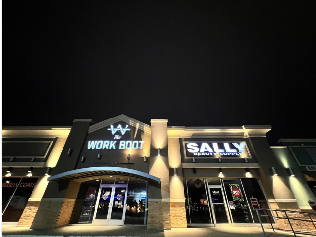
ws night 30

2401-2493 Interstate 40 W, Amarillo, TX 79109