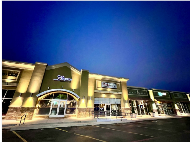
ws night 7

This space is beautiful and ready for move in! Beautiful cabinets and countertops, and 2 ADA restrooms in tact!The location within the shopping center is incredible with great foot traffic.