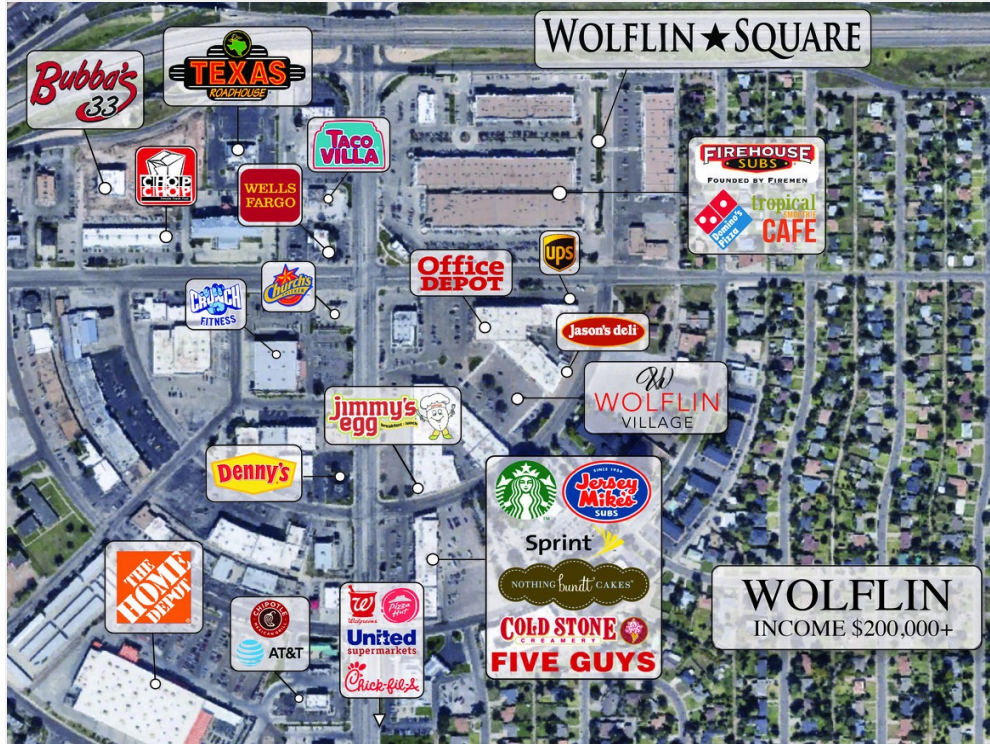
WS Map _Artboard 1