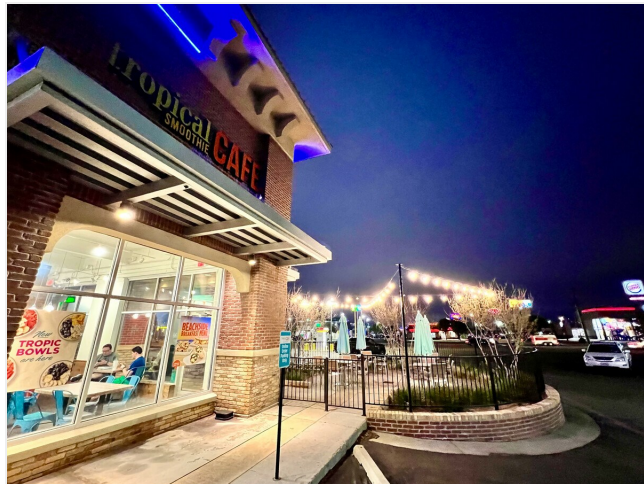
ws night 12