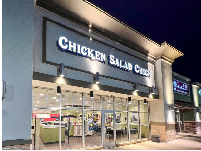
ws night 21

2401-2493 Interstate 40 W, Amarillo, TX 79109