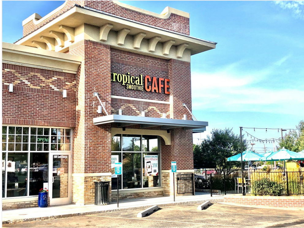
Tropical Smoothie Cafe