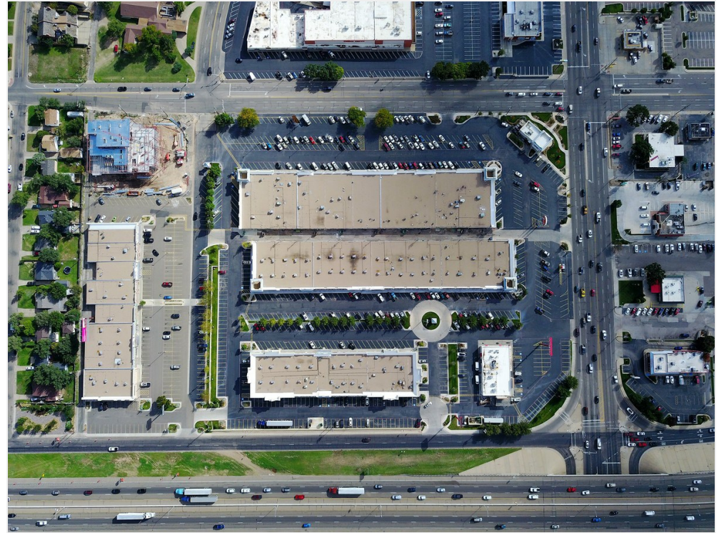
ariel ws 4