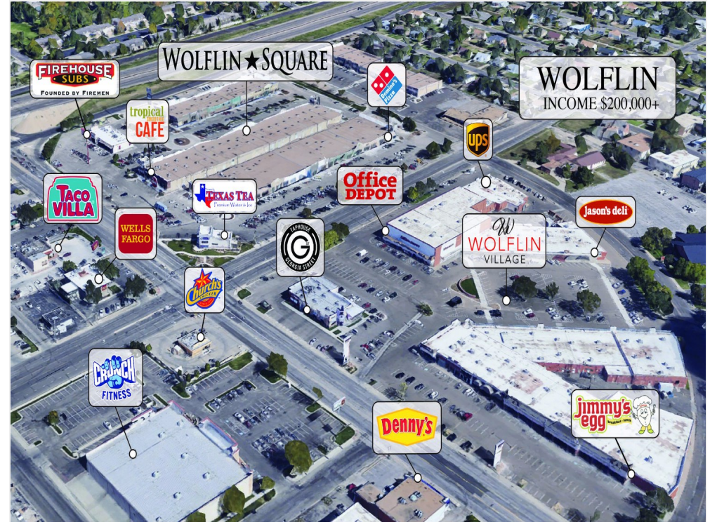
WS Map _Artboard 2