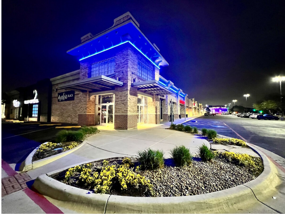
ws night 18