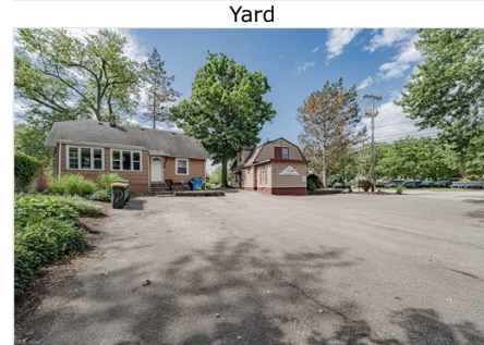
Front of Structure