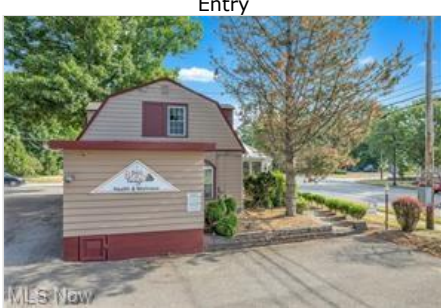
Side of Structure