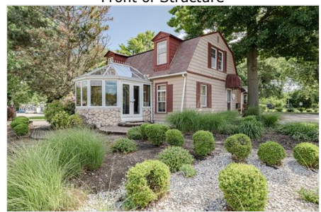
Front of Structure