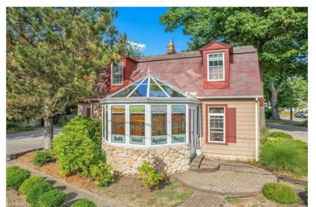
Front of Structure

Mixed Use SqFt: 0 Bsmt: Yes Yr: 1910 Acres: 0.44 $394,900