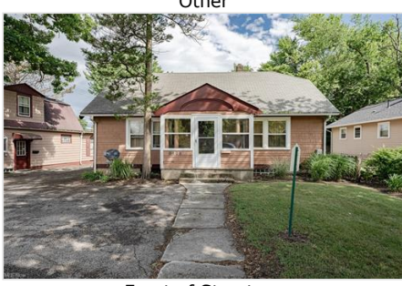
Front of Structure