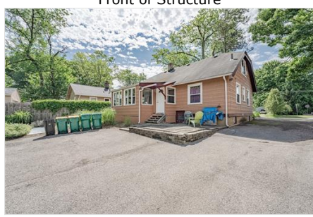
Back of Structure