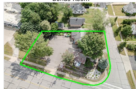
Aerial View Information is Believed To Be Accurate But Not Guaranteed