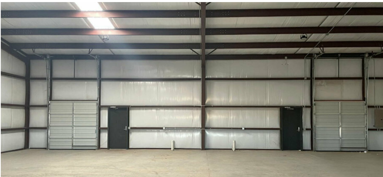
Rear Overhead Doors

SHERIL BLACKBURN | sheril@gwamarillo.com | 806.373.3111