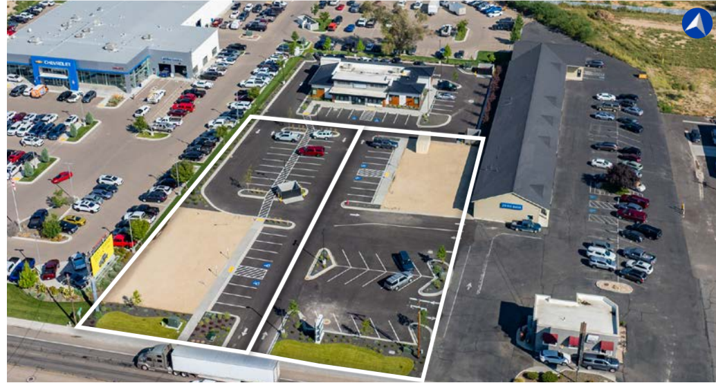
PADS B & C — 4,622 SF | .53 ACRES