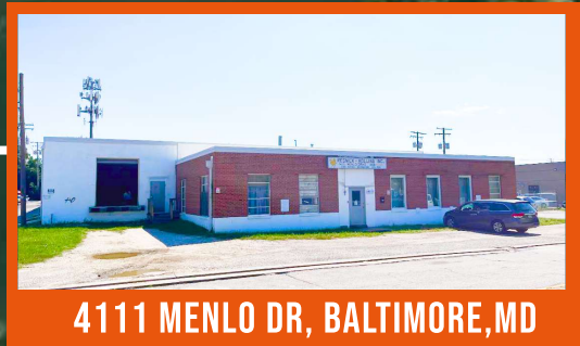
4111 MENLO DR, BALTIMORE, MD