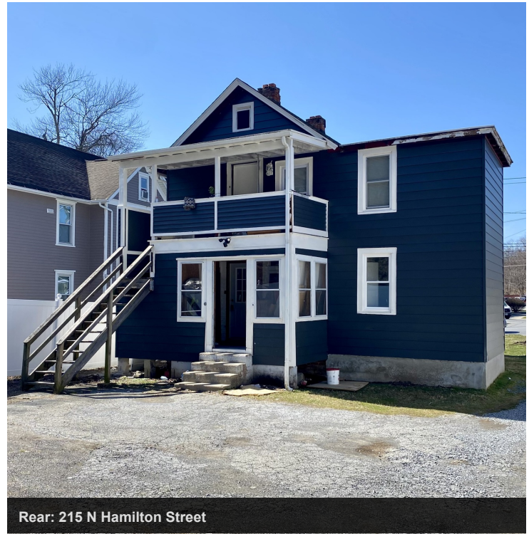
Rear: 215 N Hamilton Street