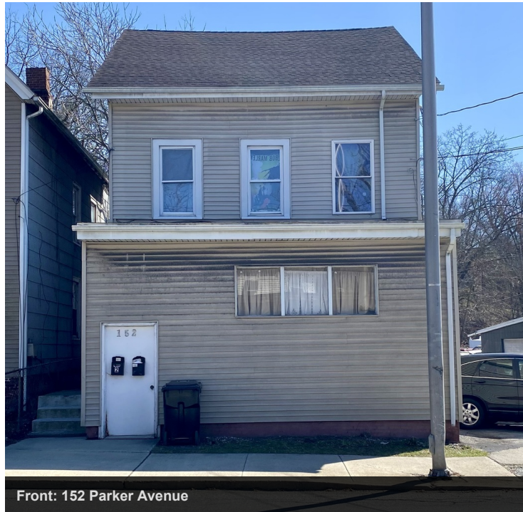
Front: 152 Parker Avenue