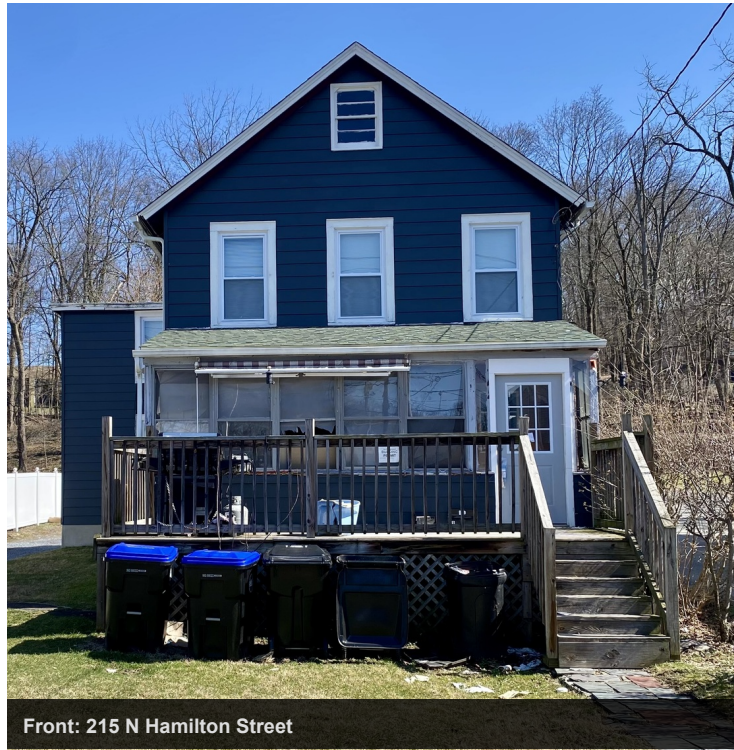
Front: 215 N Hamilton Street