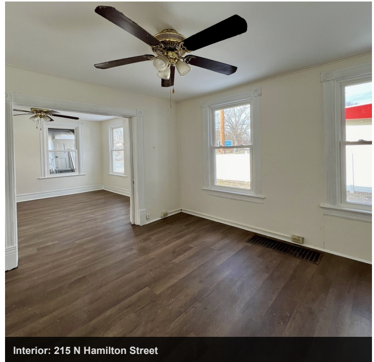
Interior: 215 N Hamilton Street