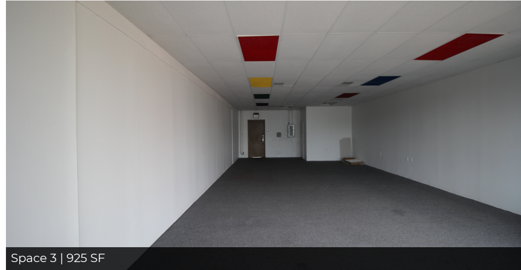
Space 3 | 925 SF