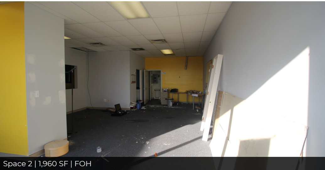
Space 2 | 1,960 SF | FOH