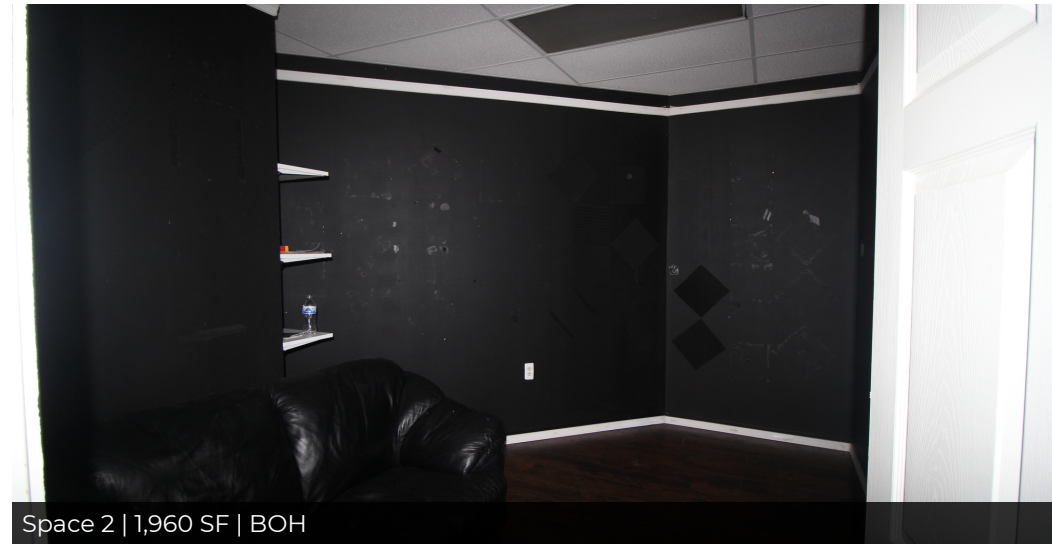
Space 2 | 1,960 SF | BOH