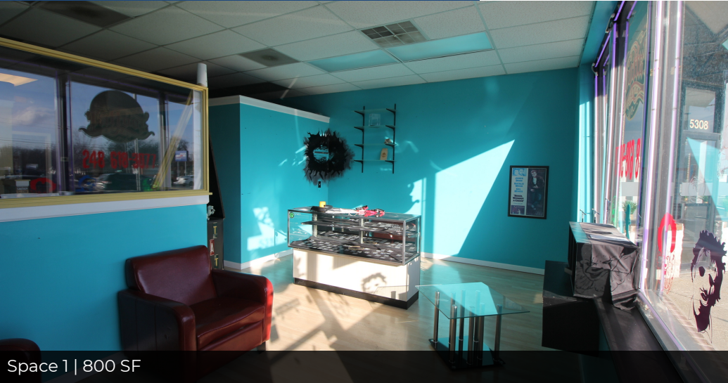
Space 1 | 800 SF