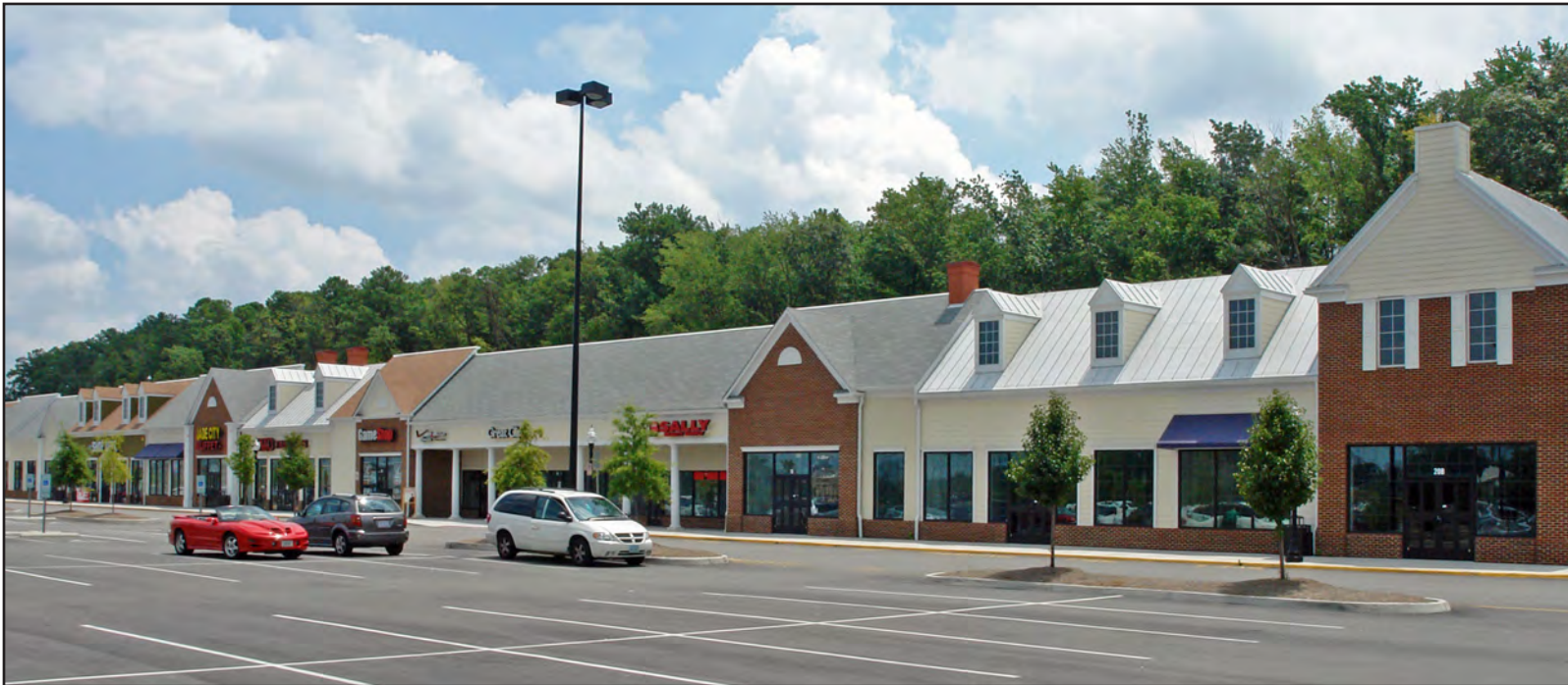
Cahoon Commons | 644-648 Grassfield Parkway, Chesapeake, Virginia