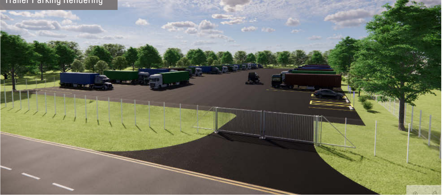
Trailer Parking Rendering