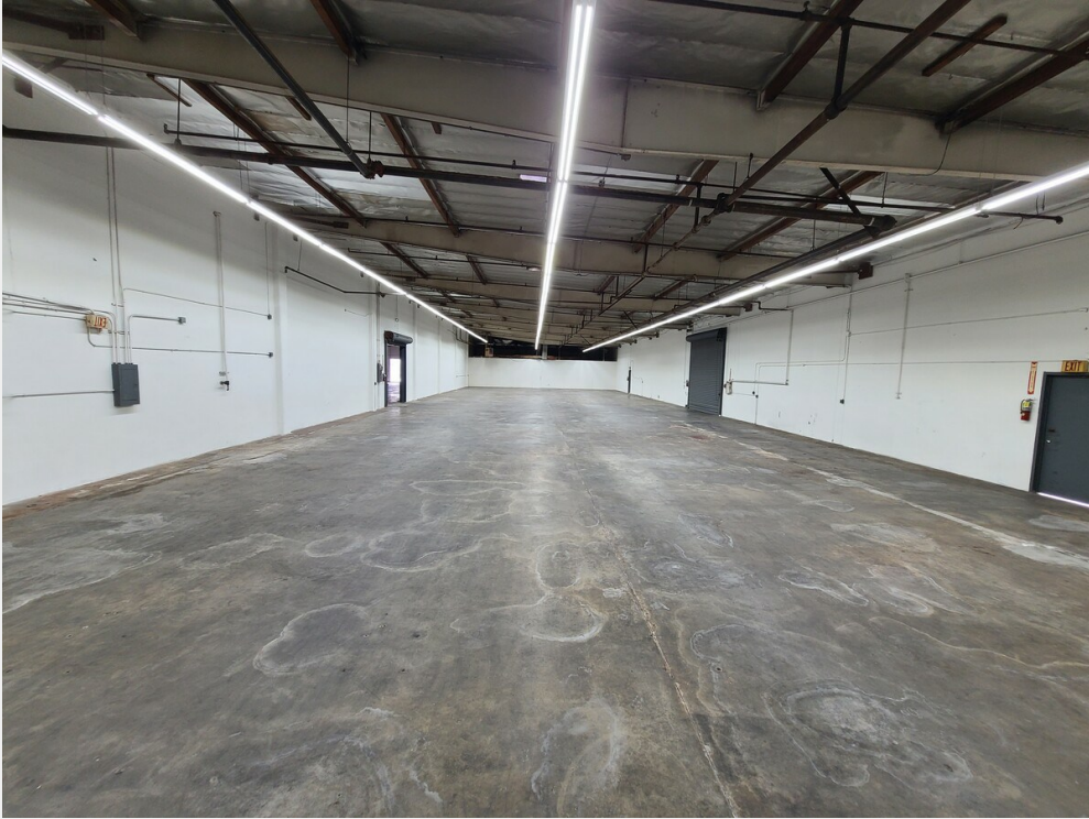
Section B 9540 sq ft