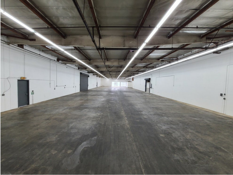
Section A 9540 sq ft