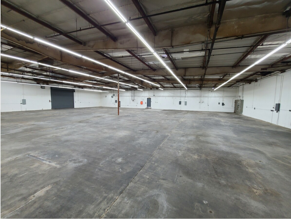
Section C 9540 sq ft