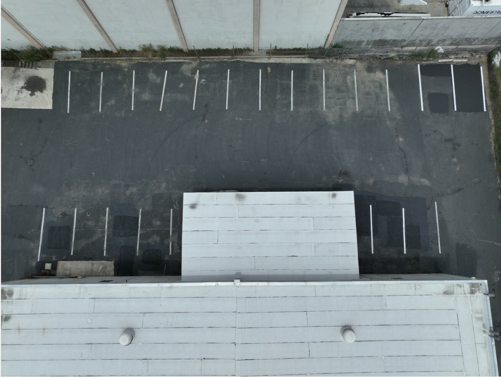
Rear parking lot