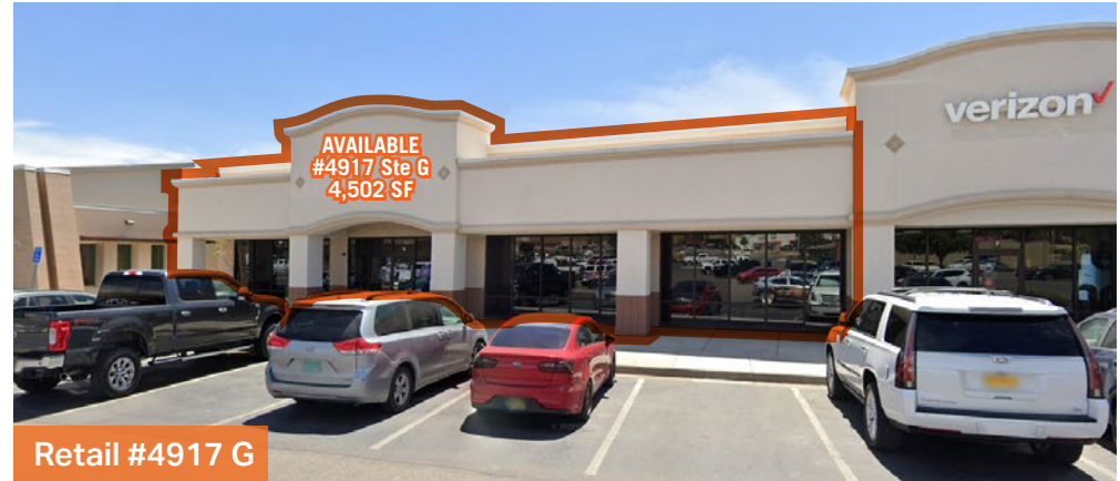
Retail #4917 G