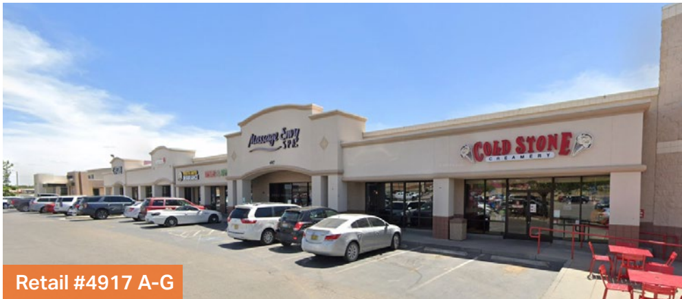
Retail #4917 A-G