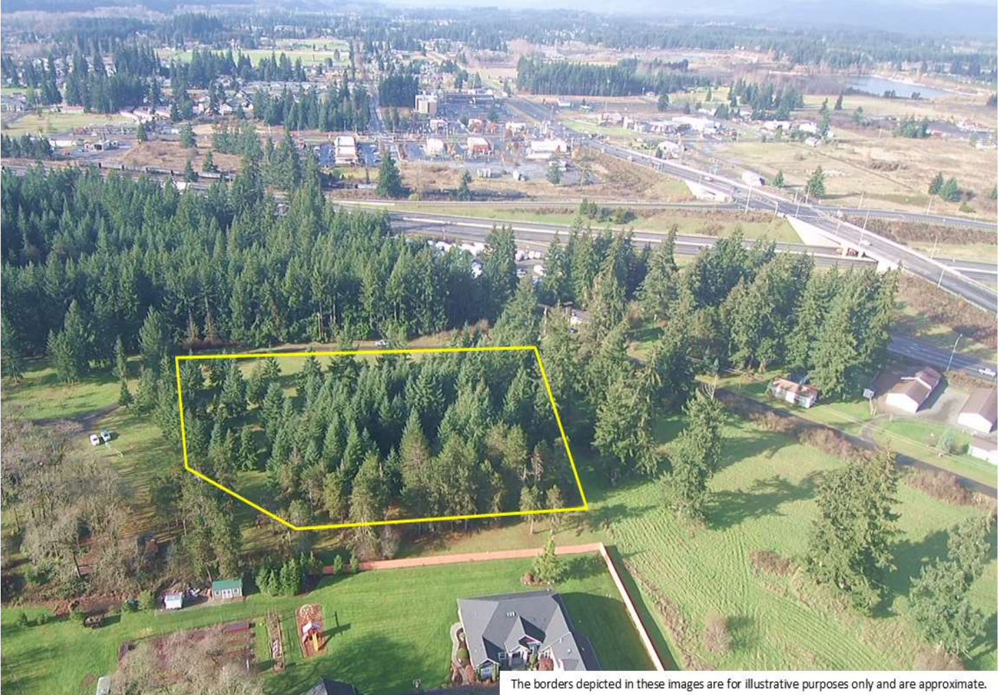
The borders depicted in these images are for illustrative purposes only and are approximate.