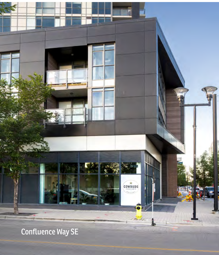
Confluence Way SE